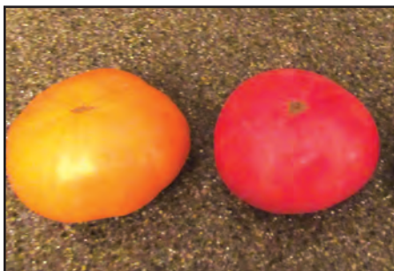
Heirloom tomatoes, Pineapple and Brandywine.

Peppers – Not as easy to grow as tomatoes, but worthwhile, once you get the hang of it. Peppers work great in containers, since