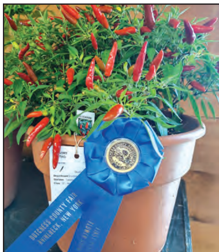
Hot peppers in a container.

Plant tomato seedlings in the sunniest location possible, three feet apart in the garden or one plant per five-gallon bucket (with drainage holes). Tomatoes prefer slightly acidic soil, which is common in the Hudson Valley. Be sure to fertilize the growing plants, especially in containers. Use cages or stakes as the plants grow, to keep the fruit off the ground. The only pest I've seen on tomatoes is the horn worm, which is more of a curiosity than a serious pest. The fungus called blight is common around here, caus-