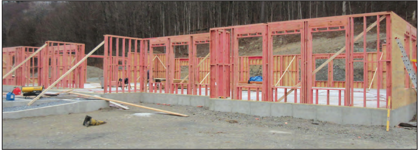
The first floor framing is in place at the new school building at Upton Lake Christian School in Clinton Corners.