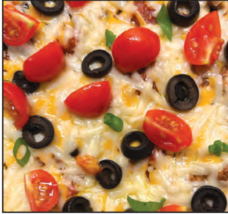
Taco Casserole: It's not just for 'Taco Tuesdays.'