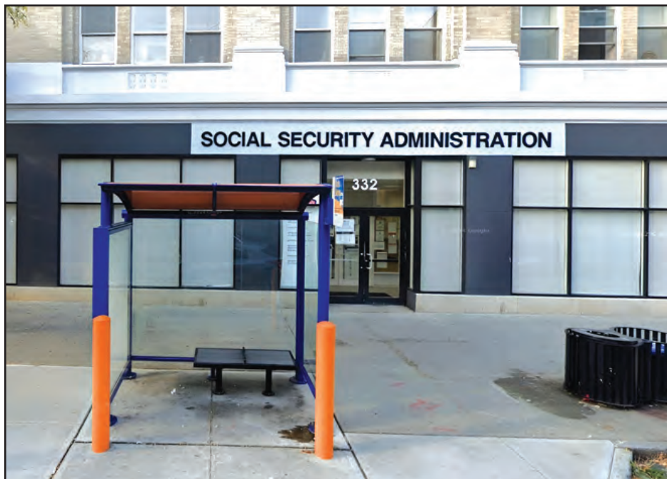
The Social Security Administration Office in Poughkeepsie will be closed temporarily due to renovations beginning Jan. 30.