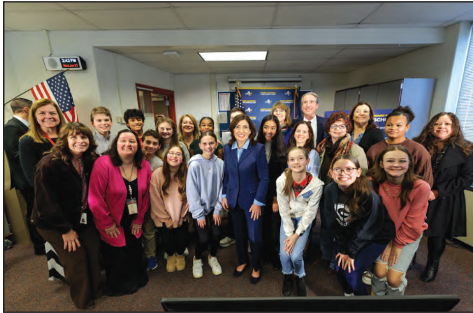
Gov. Kathy Hochul announced recently her proposal to have smartphone use restricted in schools.