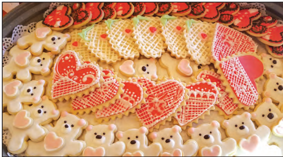
The 17th annual Mid-Hudson Love INC Cookie Walk is set for Saturday, Feb. 8 at the Poughkeepsie United Methodist Church in Poughkeepsie. Pictured are a variety of cookie platters from 2023.