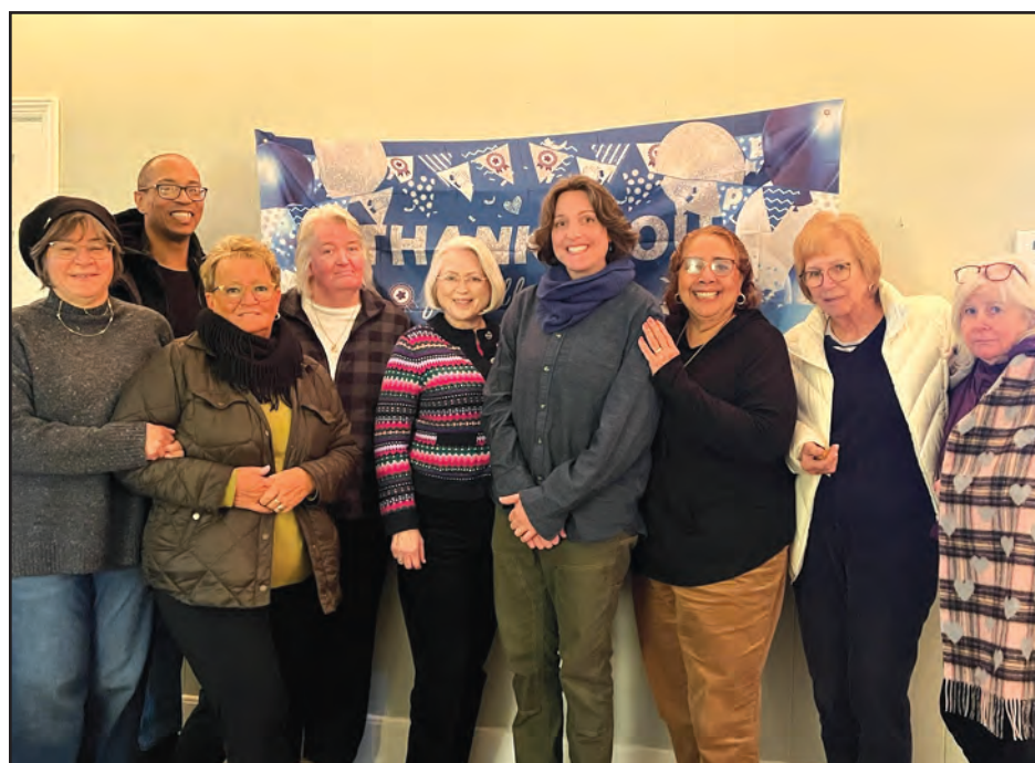
Some of the volunteers from Beacon Community Kitchen, and Fareground Welcome Table.