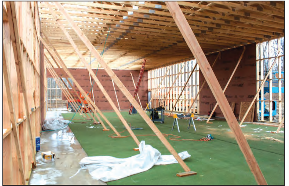
Construction is underway enclosing the batting cages to create a training facility that can be used by both teams in all weather.

The improvements are also required by Major League Baseball in order to keep