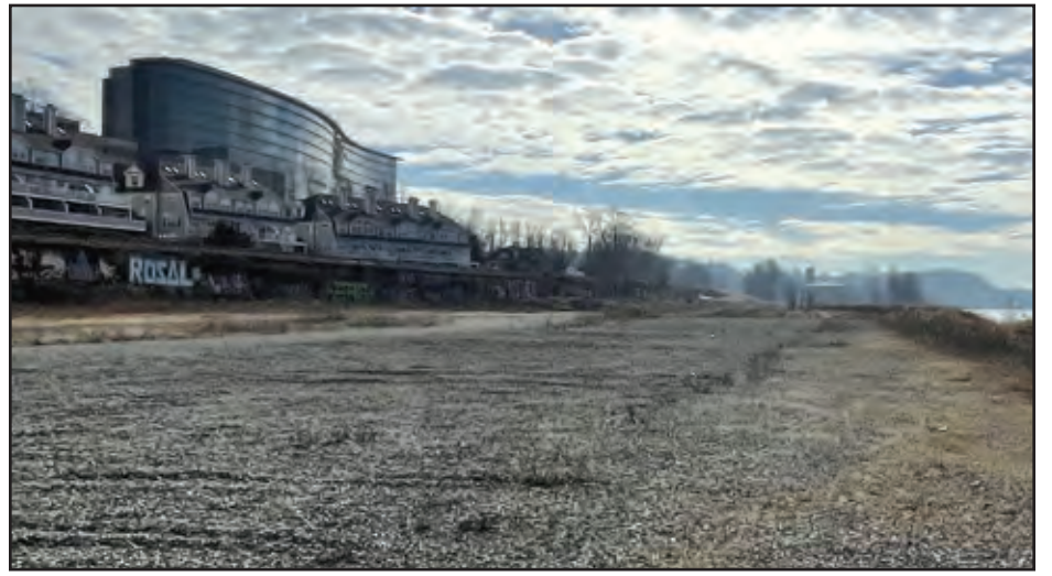
The City of Poughkeepsie is seeking requests for the development of the DeLaval site on the Hudson River waterfront.

"Careful and strategic development of this waterfront property offers us tremendous opportunity for transformative change in the City of Poughkeepsie," said Mayor Marc Nelson. "This RFEI will be well marketed, not only regionally but nationally as well. We invite those with extraordinary vision and a proven track record of success to participate as we prioritize and balance our chief objectives of achieving a continuous walkway along our waterfront, stimulating our local economy and creating jobs, attracting more visitors, expanding available housing options in the city and growing the city's tax base. The foundation for proposals should emphasize public access to the waterfront and our goal of advancing