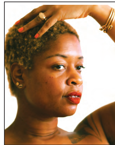
Award-winning author Junauda Petrus-Nasah will speak during a two-day Black Solidarity Conference at Dutchess Community Conference on Feb. 16.

DCC's BHM events are free and open to the public. A full calendar with more details can be found here: www.sunydutchess.edu/bhm .