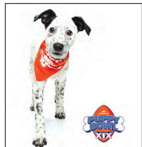
Bea will be featured in this year's Puppy Bowl on Animal Planet on February 12. Bea has been adopted and renamed Pepper since the Puppy Bowl filming.