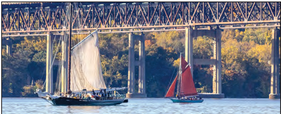
The annual Pumpkin Festival, hosted by the Beacon Sloop Club, took place on the afternoon of Sunday, Oct. 20 at Pete & Toshi Riverfront Park in Beacon. The festivities kicked off at noon. The five-hour event, run and organized by volunteers, included pumpkins, pumpkin pie, vendors, activities, music and free rides on the sloop Woody Guthrie.