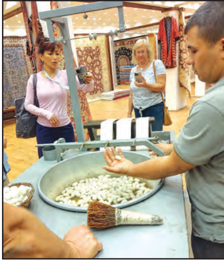
Above: making silk. Right: Santorini, land of a million Instagram posts.