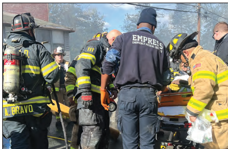
The PSC recently released results from a preliminary investigation into the Nov. 2023 natural gas explosion on Brick Row in Wappingers Falls. Pictured is one of the injured being assisted by first responders after the explosion last year.