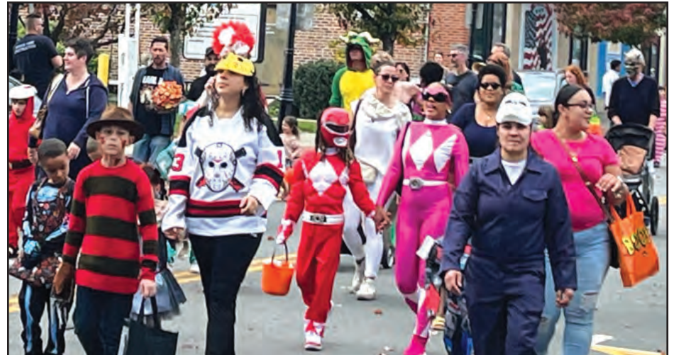
The annual Hocus Pocus Halloween Parade will take place on Main St. on Saturday, Oct. 26 in Beacon.

"It's a great community event where everyone is welcome to get dressed up