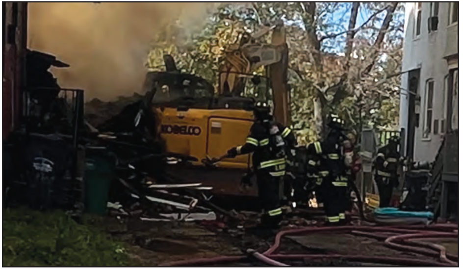
The PSC recently released results from a preliminary investigation into the Nov. 2023 natural gas explosion in Wappingers Falls. Pictured, firefighters work to put out the fire on Brick Row in 2023.

- From October 13, 2023, to November 2, 2023, Central Hudson allegedly failed to adequately make available its maps and/or records of its service lines of 4 Brick Row to