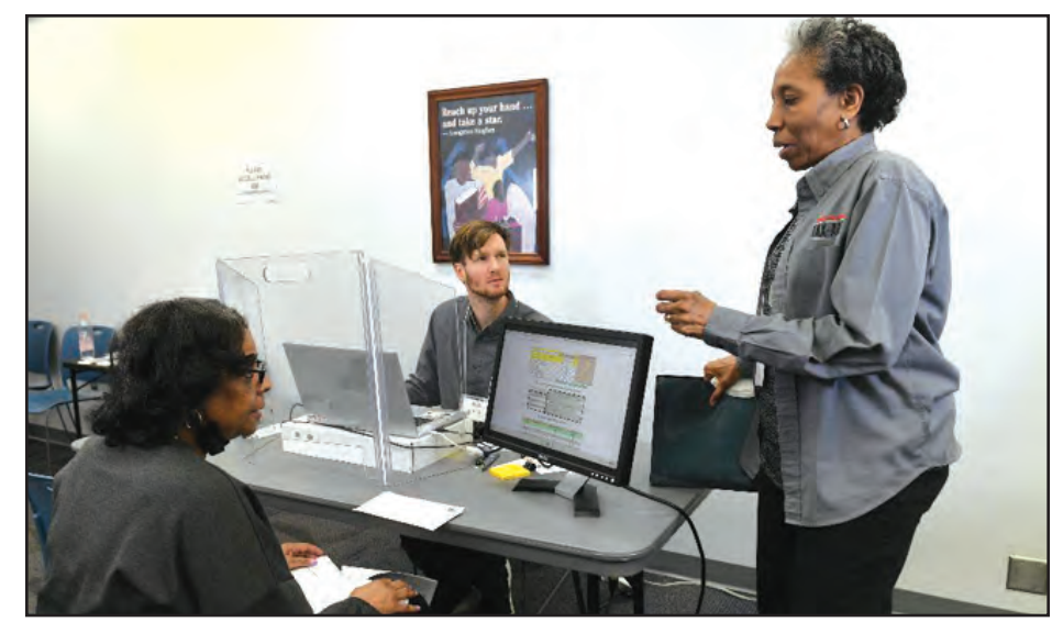
Hudson Valley CA$H Coalition and AARP Foundation Tax-Aide seek volunteers for the upcoming tax season. Pictured is from last year's tax season.