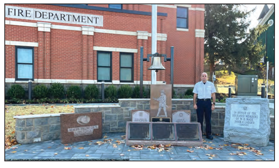
The newly renovated firehouse on Wolcott Ave. (Route 9D) in the City of Beacon. An open house is set for Nov. 16. Pictured is City of Beacon Fire Chief Thomas Lucchesi with the monuments honoring the City's firefighters.