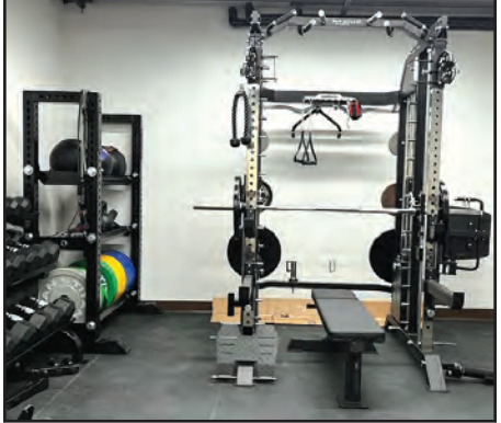
Part of the gym in the firehouse.

The public is invited to browse a wide selection of gently used books for readers of all ages, for sale at bargain prices. All proceeds benefit the South Avenue Elementary School PTA. The Reduce, Recycle, Read! Used Book Sale will be held on Saturday, November 23, from 10 a.m. -2 p.m.