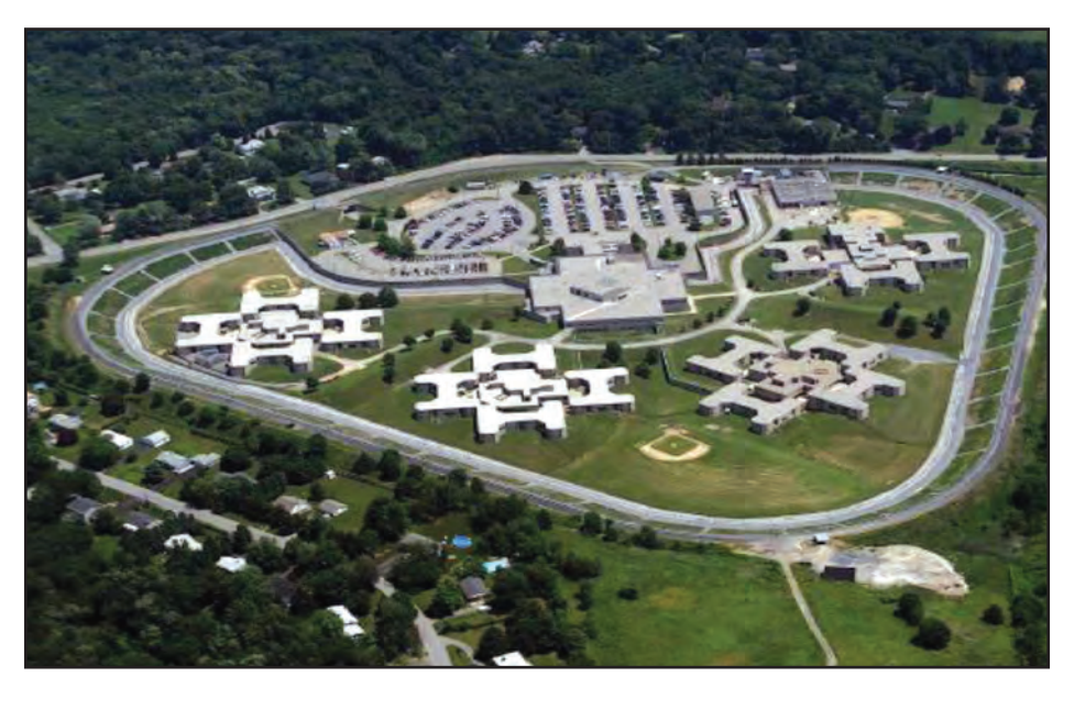
An aerial view of the site of the former Downstate Correctional Facility in the town of Fishkill.

Whitted leads Beacon to victory Not bad for coming off the bench.