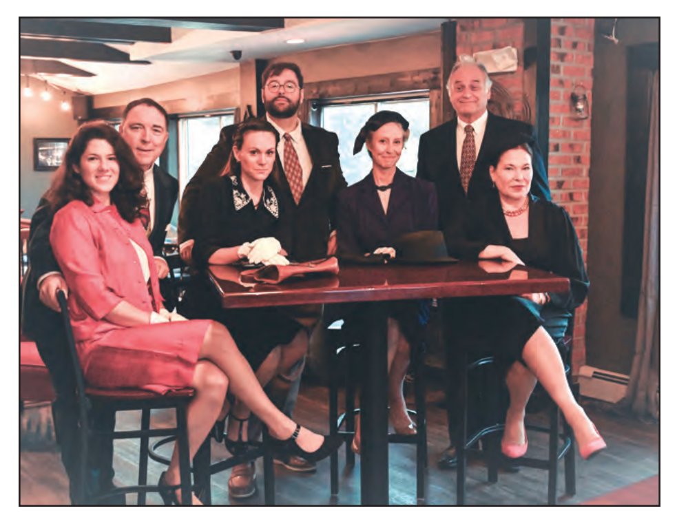
Members of the cast of "Perfect Arrangement." The contemporary comedy can be seen from Nov. 8-23 at County Players in Wappingers Falls.

If one requires wheelchair accessibility, contact the Box Office at 845-298-1491.