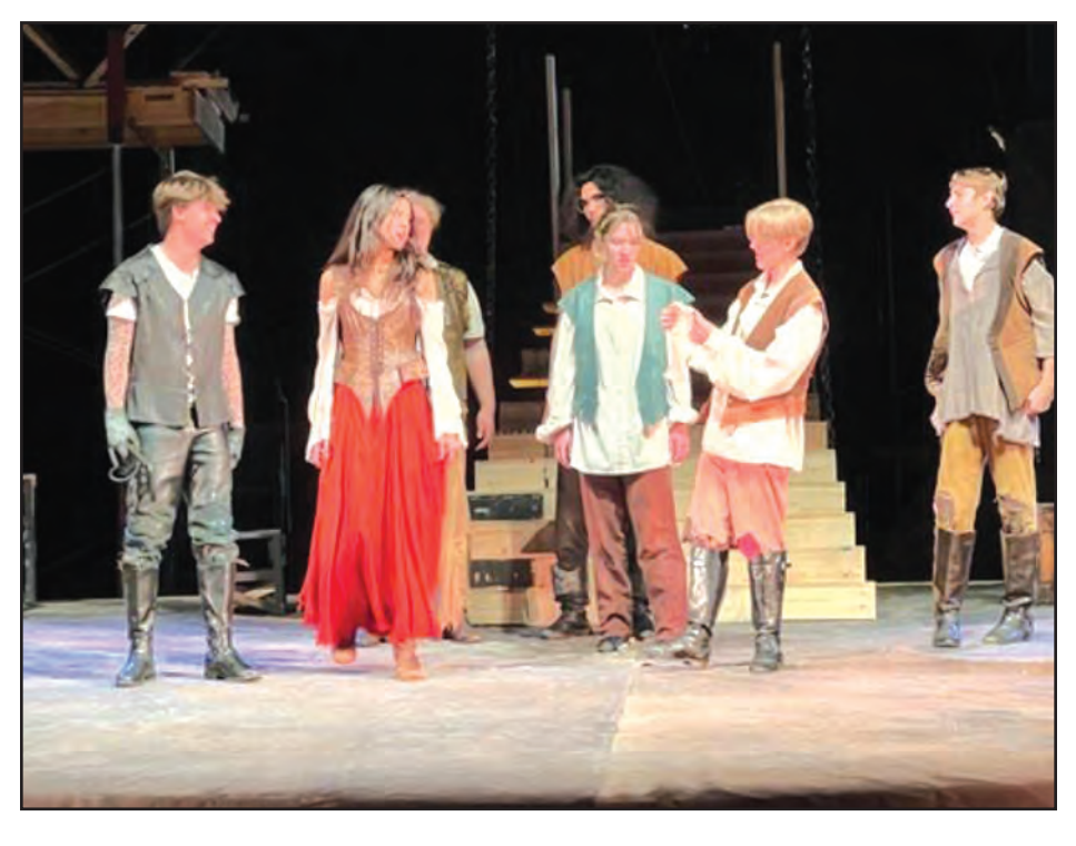
A recent rehearsal of "Man of La Mancha" at Beacon High School by the Beacon Players.

Working on the sets is a "great experience that has exposed me to many possible career paths. I've also met many amazing people and made a lot of new