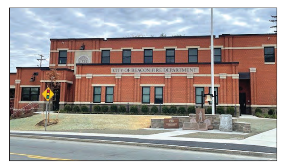
The renovated City of Beacon Firehouse on Wolcott Ave. (Route 9D), across the street from Municipal Plaza.