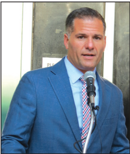
County Executive Marc Molinaro -Archive photo

“As Governor, my two top priorities are to protect the health of New Yorkers and to protect the health of our economy. The temporary measures I am taking today will help accomplish this through the holiday season,” said Hochul in a press