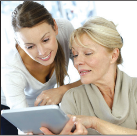
Through CDChoices and New York State's Consumer Directed Assistance Program, consumers control their own care by searching, interviewing, hiring, and training personal assistants.

Portal features include: • Direct Messaging – The workforce recruitment portal will enable secure, direct communications between consumers and personal assistants within the system. This feature will alert users by email or mobile text message each time they receive a communication in the portal. Not only does this protect user privacy, but it is an efficient way to communicate in real-time before scheduling an interview. • Sort and Filter Options – The workforce recruitment portal will enable a "sort" feature that allows consumers to organize applicants by their most recent log-in, profile creation date, and loca-