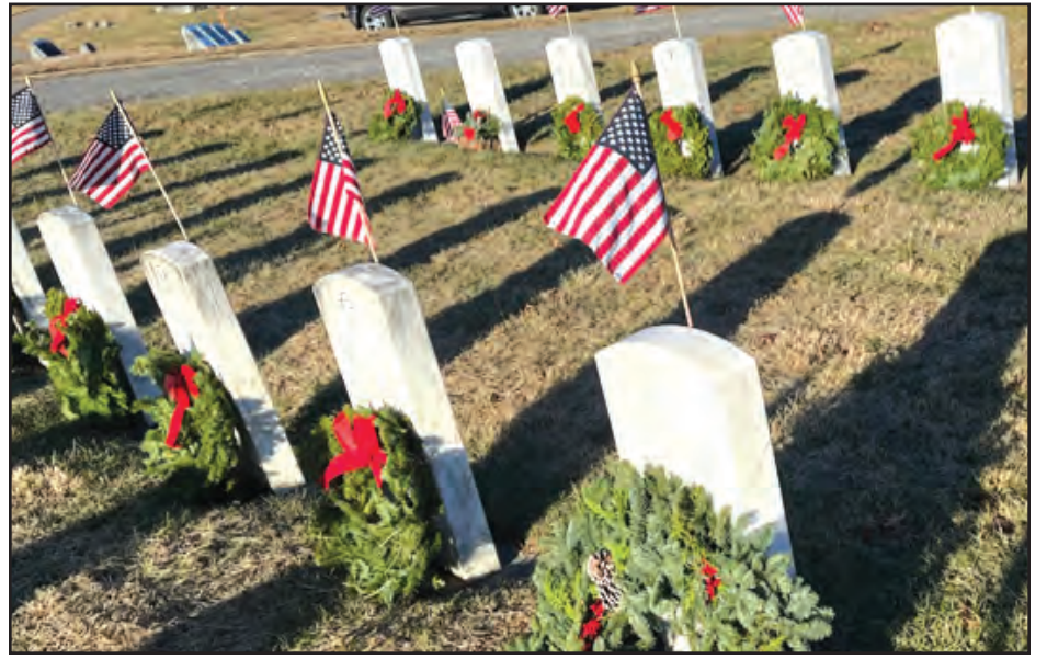
Wreaths were placed on veterans' graves in Fishkill Rural Cemetery as part of Wreaths Across America.

Fishkill resident Jim Broughton, a U.S. Air Force veteran, attended the ceremony.