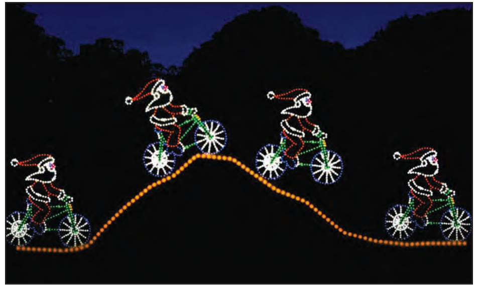
The family-friendly drive-through experience of The Wonderland of Lights™ will take place through Dec. 29, at the Dutchess County Fairgrounds, in Rhinebeck.

A cash donation section has been added as well online on the ticket purchase page. Visit the website at www.thewonderlandoflights.com for