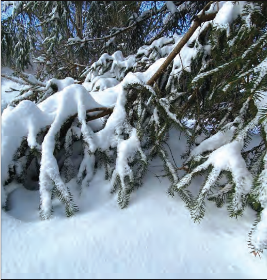
“Snow Angel Tree” by Phyllis Chadwick.