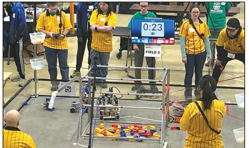
Judging taking place during the recent FIRST Tech Challenge Robotics Tournament Qualifier held at John Jay High School in East Fishkill.