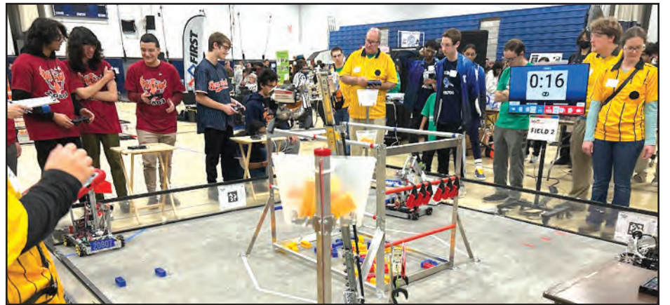
More than two dozen teams competed in the recent FIRST Tech Challenge Robotics Tournament Qualifier at John Jay High School in East Fishkill.