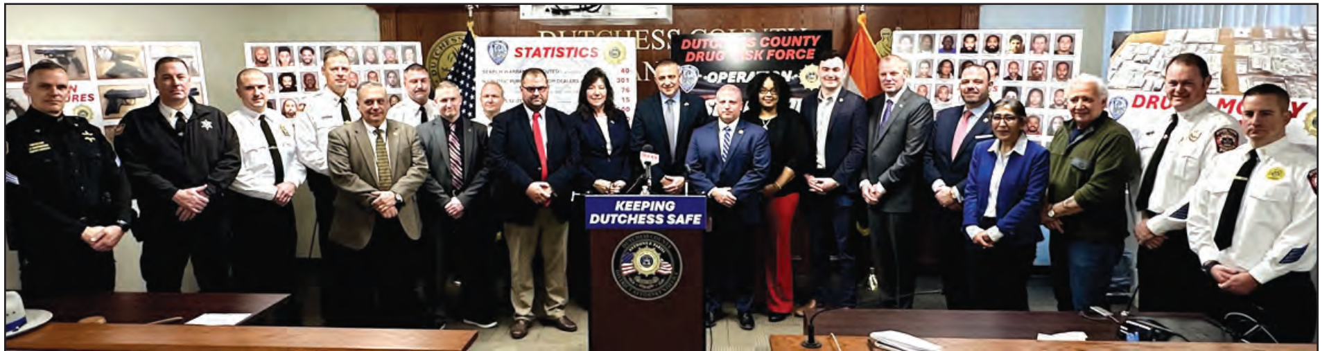
Operation Fast and Furious participating law enforcement officials held a press conference on Wednesday, Dec. 11 to announce a 50% reduction in overdose deaths in 2024.