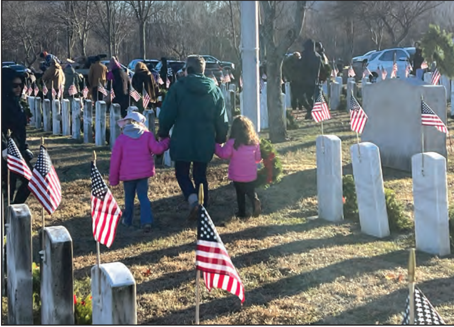
Attendees carry and place wreaths on graves of veterans in Fishkill Rural Cemetery. The ceremony was part of Wreaths Across America, which is held at cemeteries throughout the country.