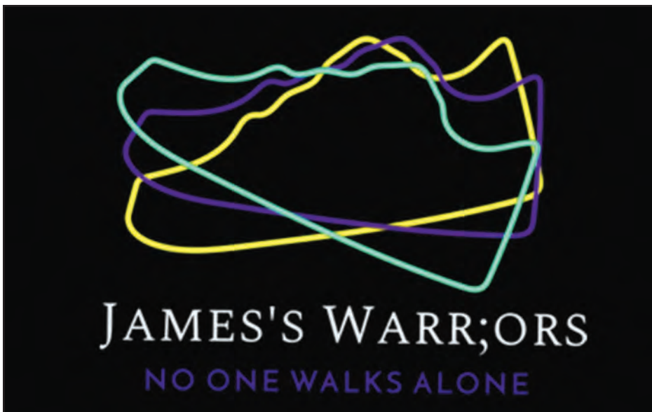
The logo for James's Warr;ors.

Sessions will take place in Beacon, New York, on six consecutive Wednesday evenings from January 22, 2025 through February 26, 2025, from 5 - 6 p.m. While each family will cope with loss uniquely,