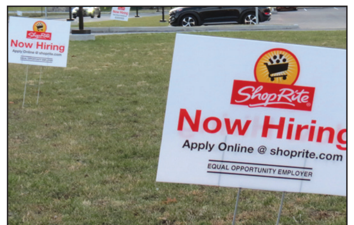
Signs like these are common all over Dutchess County as employers seek to fill openings.