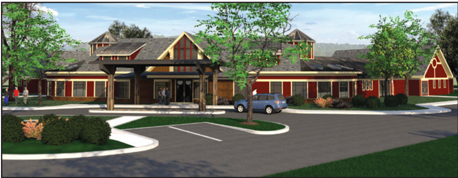
Hudson Valley Hospice broke ground for a new $10 million Hospice House, the first of its kind in Dutchess County. It is expected to open in 2023.

on seven wooded acres, with 14 private suites which will support all levels of hospice care needed by patients at the end of life. Each private suite will be approximately 400 square feet and have a large private bathroom, individual control of the room temperature, and convertible chairs and sofas allowing loved ones to stay overnight. The suites will be tastefully decorated and encourage the display of personal items, photos, art, books, and other life-enriching mementos to add to the homelike environment, while doors in each room will open onto a Meditative Garden, offering patients and their loved ones the opportunity to enjoy a peaceful and tranquil outdoor environment. Two suites will be convertible for pediatric patient care to meet the extraordinary needs of our youngest patients and their loved ones.