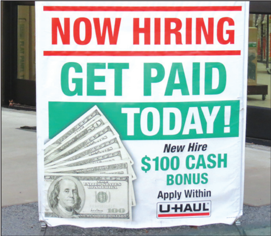
A help wanted sign outside of a local U-Haul. Applicants may apply and learn about possible bonuses.