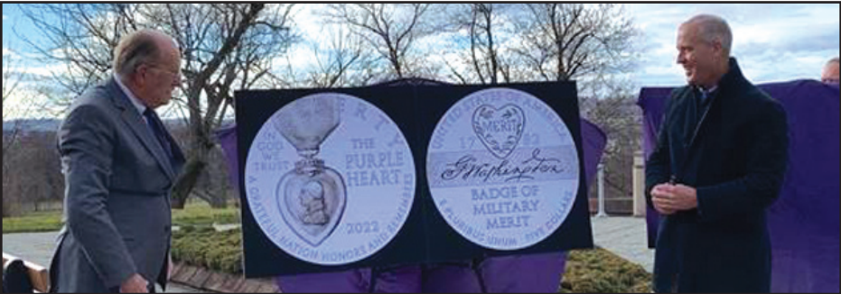
Congressman Sean Patrick Maloney, right, unveils the Purple Heart Commemorative Coins during a ceremony held at VA Hudson Valley Health Care System Castle Point campus on Dec. 4.