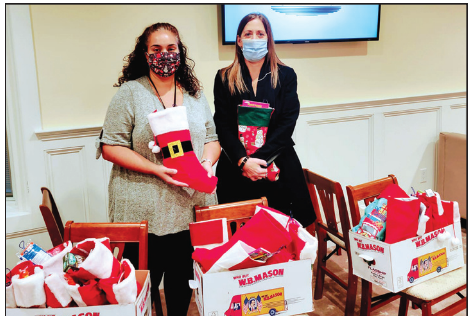
Beacon City School District members donate stockings to Libby Funeral Home's annual Stockings for Veterans program.

Putting together the stockings and receiving the donation helps put the community in the holiday spirit, said