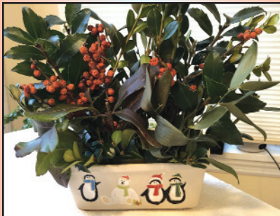
One of the centerpieces made by the Verplanck Garden Club for Meals on Wheels of Wappingers Falls.