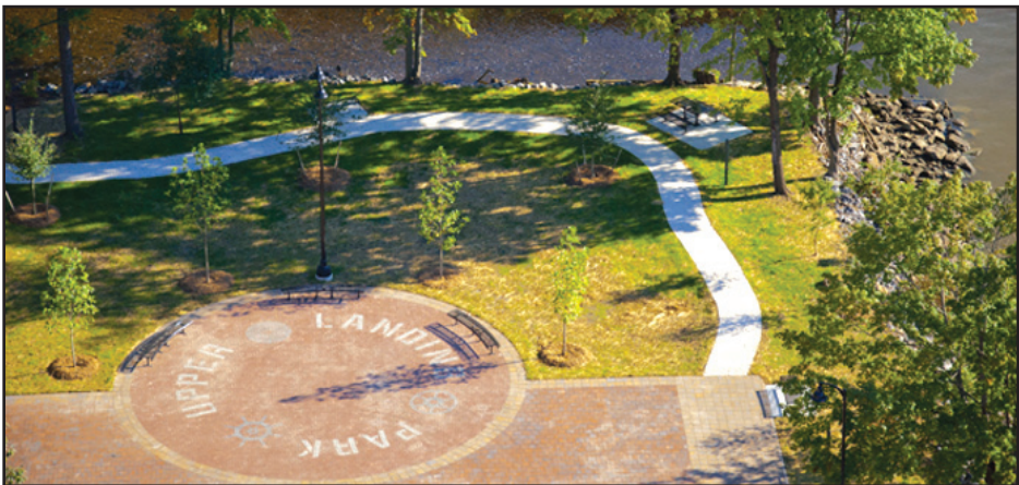
The Dutchess County Legislature voted recently to approve the acquisition of Upper Landing Park in the City of Poughkeepsie, which is a donation from the Dyson Foundation.

The property has a rich history, first serving as hunting and fishing ground for Native Americans for thousands of years. It became one of the first areas to be settled in Dutchess County by Europeans and has served as homestead, mill site, commercial dock, Revolutionary War depot, industrial hub, and electrical power generation source for the surrounding area.