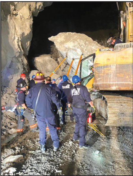
A man was trapped in the cab of an excavator in a Dover mine. Multiple agencies responded and rescued the man, who was transferred to Westchester Medical Center with non-life-threatening injuries.

J.H. Ketcham Hose Company was assisted at the scene by Arlington, LaGrange and City of Poughkeepsie