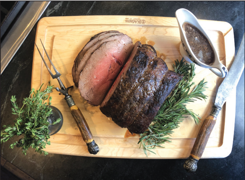
Spoon roast.

meat forks please. You can leave it in the pan, too.) and loosely tent it with foil. Then let it rest that way for 15-20 minutes. No really. I mean it! You'll thank me if you didn't already know this. Why rest? If you were to carve the roast when it's hot, all those lovely, flavorful juices end up being wasted on your cutting board. Great for making gravy, sure, but not for a tender, juicy roast. Resting, and therefore cooling slightly, gives those juices time to soak back into the meat and essentially being redistributed throughout. Don't worry – you'll still have enough to make a sauce! If you want sauce, that is. Use some of that juice to make a gravy, pour it into a pitcher to serve au jus or add it to sauteed mushrooms with a little butter and red wine. Serve your roast with your favorite vegetables (I'll be making creamed spinach and roasted Brussels sprouts), potatoes your favorite way (I'll roast baby potatoes at the same time as the meat). For dessert we'll have crème brulee, which, in addition to being a