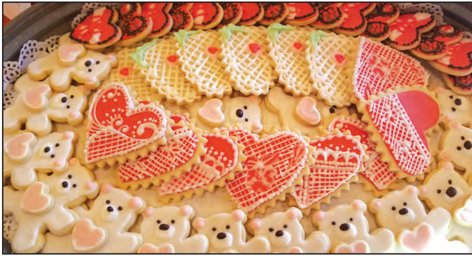
The 17th annual Mid-Hudson Love INC Cookie Walk is set for Saturday, Feb. 8 at the Poughkeepsie United Methodist Church in Poughkeepsie. Pictured are a variety of cookie platters from 2023.