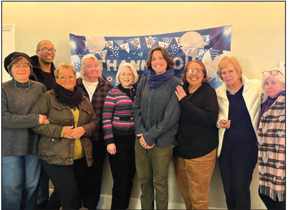
Volunteers from Beacon Community Kitchen, and Fareground Welcome Table.