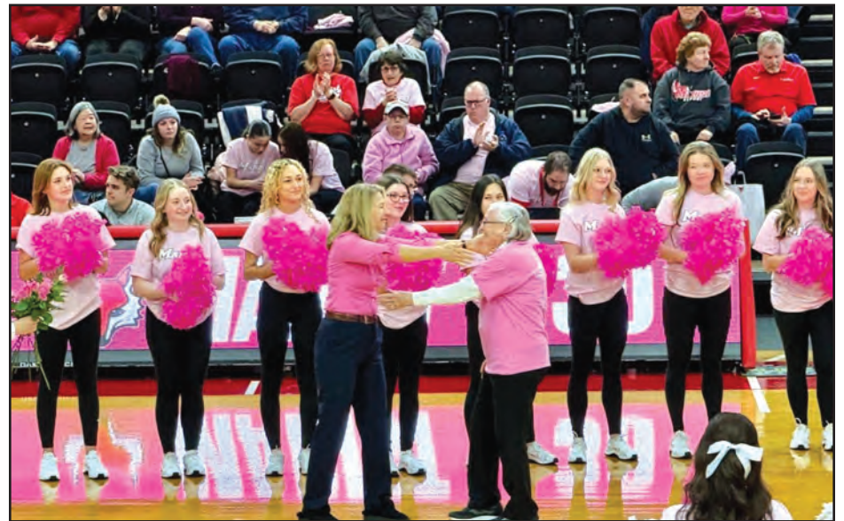
Right: At a previous Marist College Pink Game, Marist Athletics Department and Miles of Hope recognize breast cancer survivors with a special on-court ceremony at halftime. This year's event on Saturday, Feb. 15, will continue this tradition.

Visit www.milesofhope.org for more information.