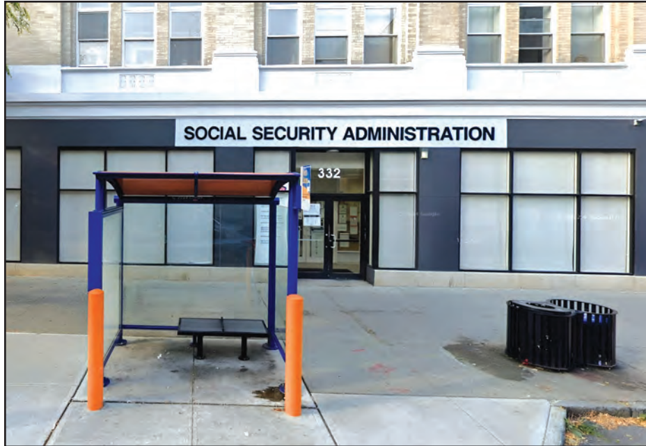
The Social Security Administration Office in Poughkeepsie will be closed temporarily due to renovations beginning Jan. 30.