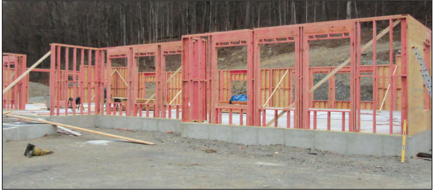
The first floor framing is in place at the new school building at Upton Lake Christian School in Clinton Corners.