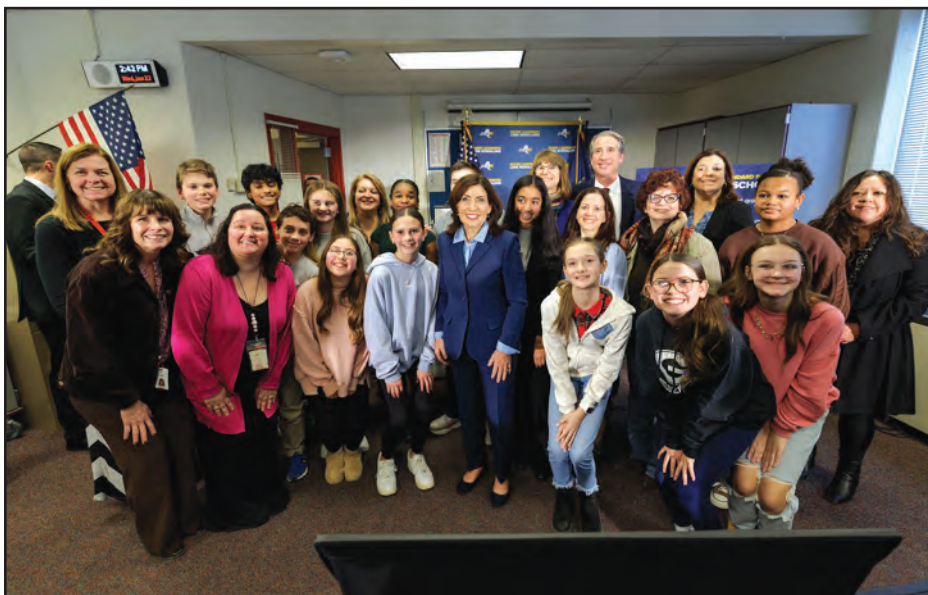
Gov. Kathy Hochul announced recently her proposal to have smartphone use restricted in schools.