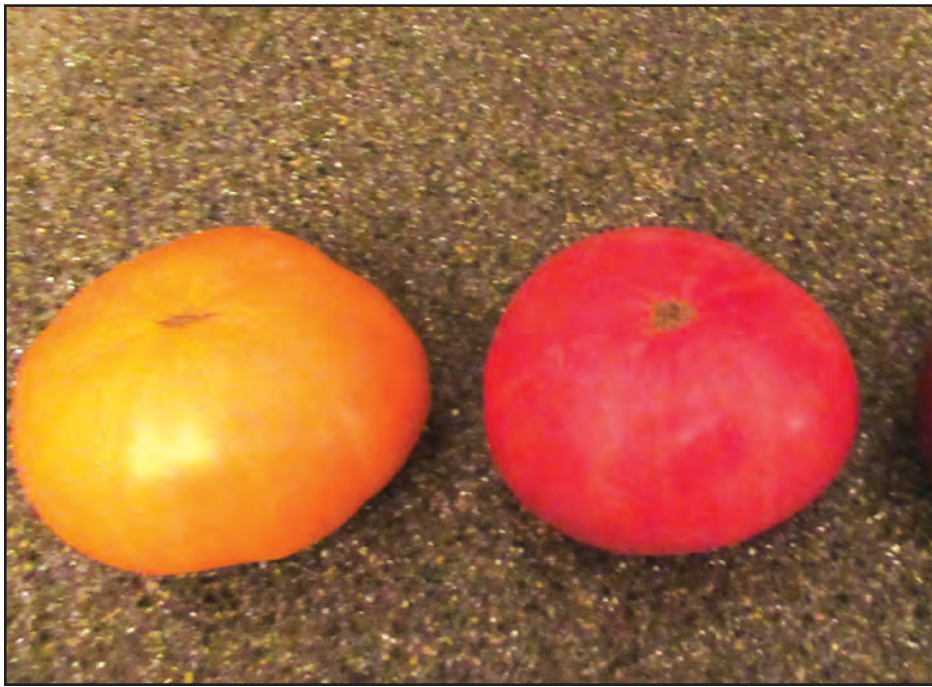
Heirloom tomatoes, Pineapple and Brandywine.

Growing tomatoes, peppers and onions in home gardens