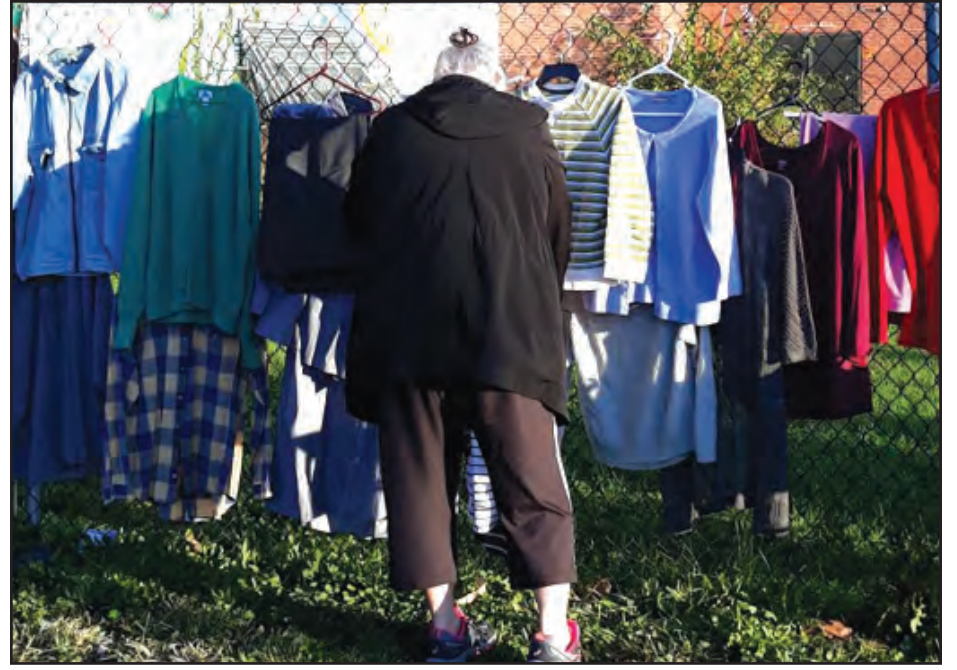
Clothes are neatly displayed by "Taking It To The Streets" volunteers for those who are in need.

"Giving donations to "Taking It To The Streets" is good and appreciated, but