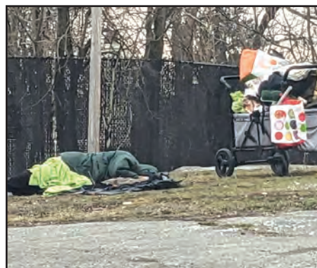
"Taking It To the Streets" provides clothing, food and treats all with dignity for those who are homeless.