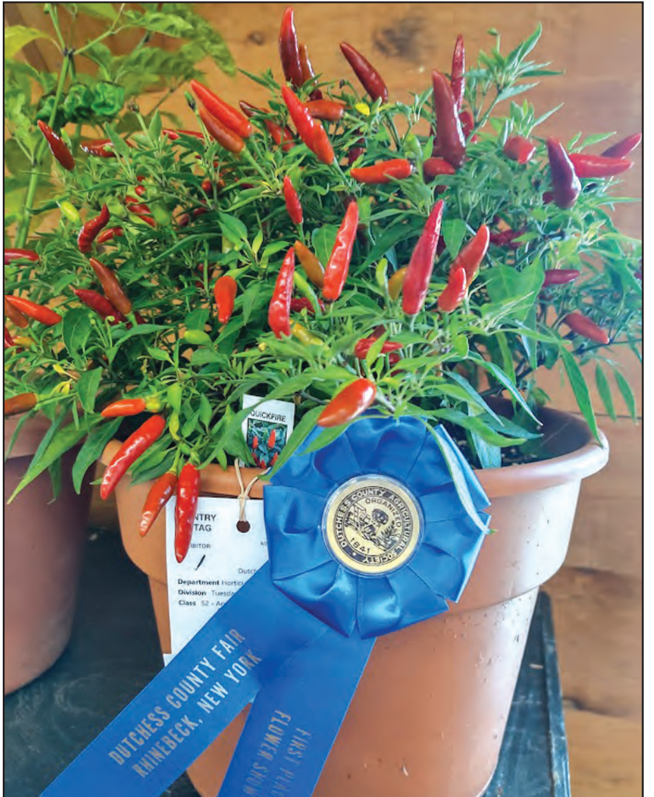
Hot peppers in a container.