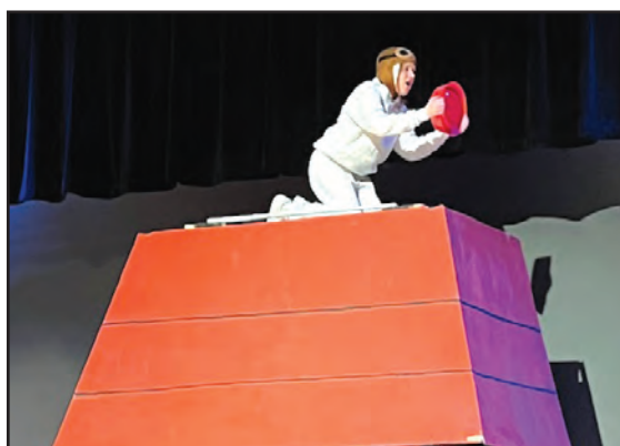
“You’re a Good Man Charlie Brown,” at Beacon High School on Feb. 9 - 10, will feature the Peanuts gang, including Snoopy.