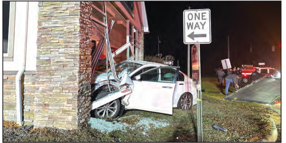
The Hughsonville Fire Department responded to a vehicle into a building at Tech Air, 1123 Route 9, at the intersection of Smithtown Road in the Town of Wappinger on Feb. 1. The accident is under investigation.