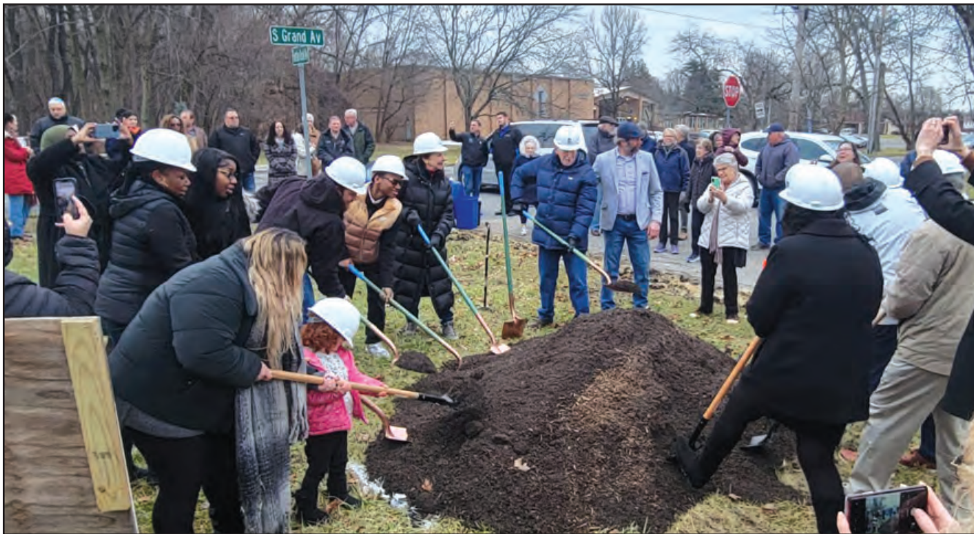
Habitat for Humanity of Dutchess County held a groundbreaking ceremony for two new houses at South Grand Ave. and Fountainbrook Ave. in the City of Poughkeepsie on January 31.