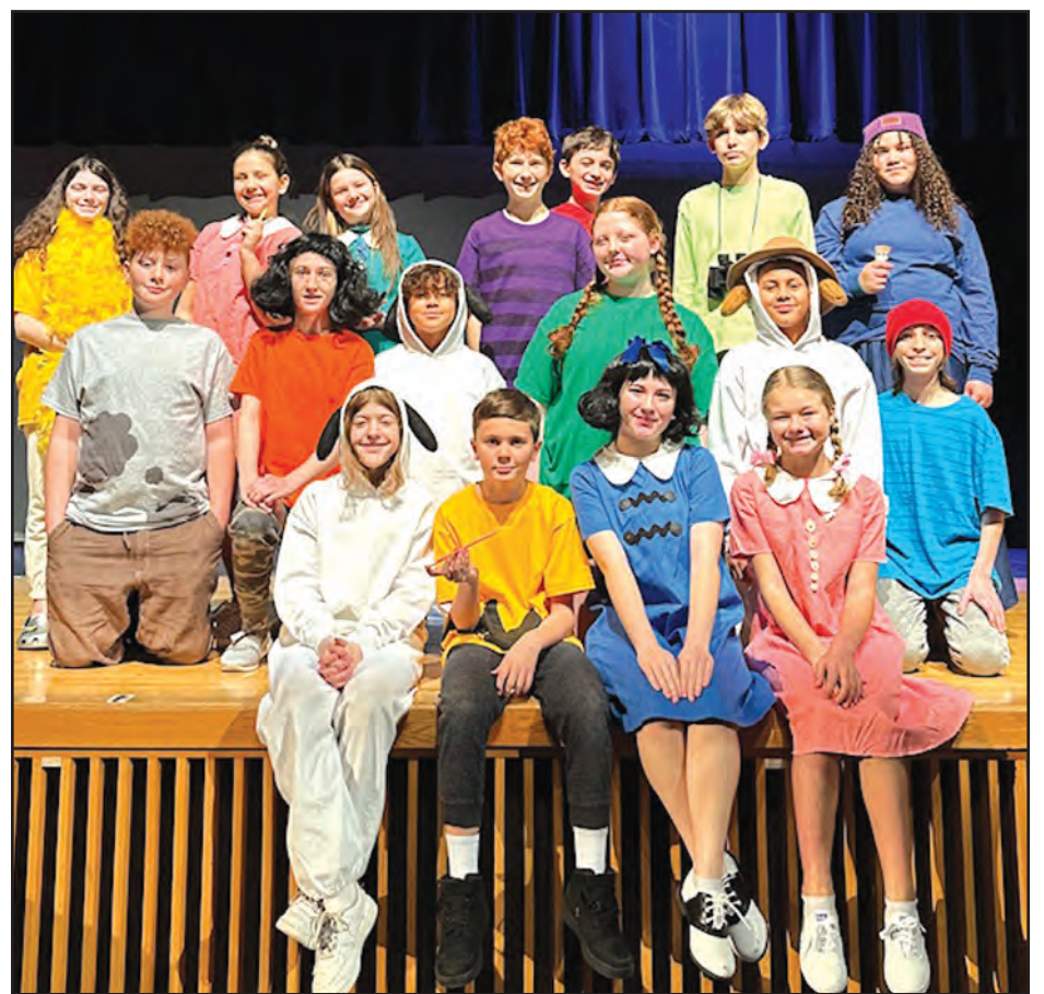
The cast of "You're a Good Man, Charlie Brown."