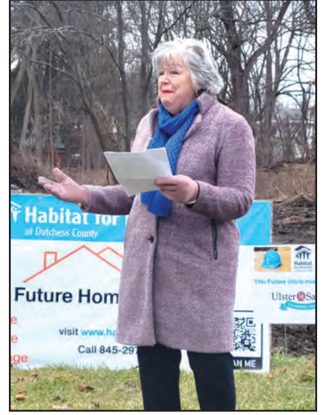
Habitat for Humanity of Dutchess County held a groundbreaking ceremony for 2 new houses in the City of Poughkeepsie. In attendance was Dutchess County Executive Sue Serino (center).