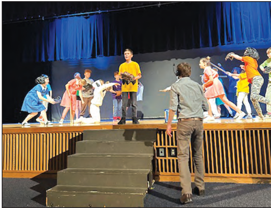
"You're a Good Man, Charlie Brown" can be seen at Beacon High School, 101 Matteawan Rd., in Beacon on Feb. 9 and 10. Pictured is the cast during a recent rehearsal.