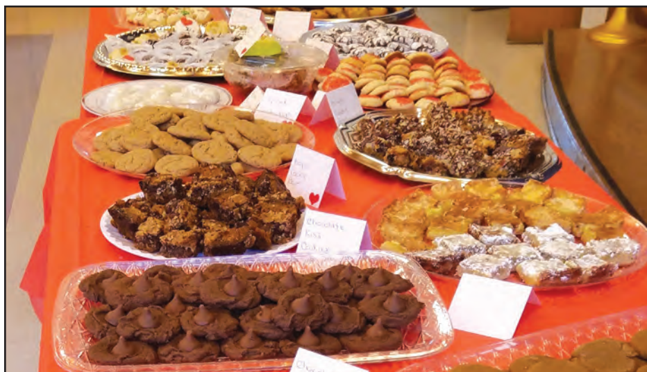
The annual Cookie Walk by Mid-Hudson Love INC will take place on February 10 in Poughkeepsie. Pictured are cookies from last year's Cookie Walk.