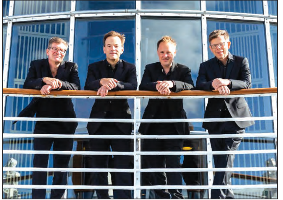
The Munich Philharmonic String Quartet will perform a Valentine’s Day-theme concert at St. George’s Church in Newburgh, Orange County, on Feb. 9.