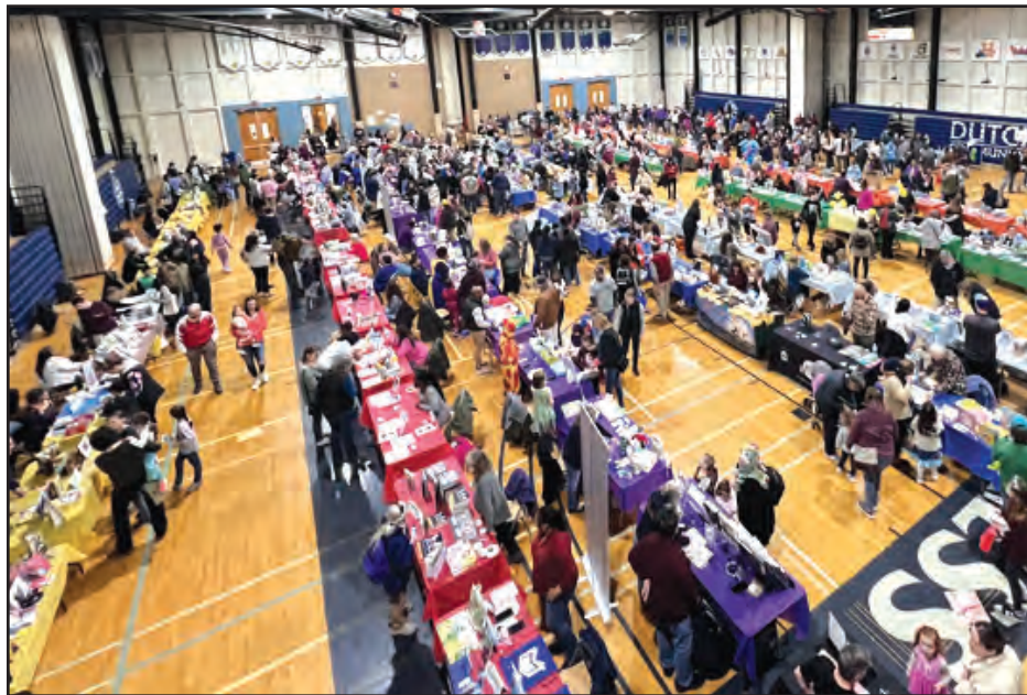
The Poughkeepsie Children's Book Festival will take place on March 29. The event will be held in Falcon Hall on the Dutchess Community College campus in Poughkeepsie.