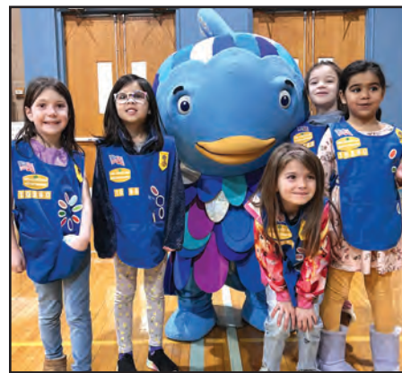
The Poughkeepsie Children’s Book Festival will be held at Falcon Hall at Dutchess Community College on March 29.