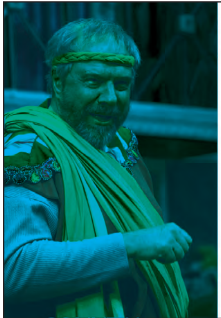
See 'behind the scenes' at County Players with a free tour on April 5.

Upon arrival, guests will receive a map highlighting stations of interest where they can learn more about the various production departments. During the self-guided tour attendees will have an opportunity to interact with several of our dedicated volunteer personnel, including costume, lighting and sound design, set and prop construction. Visitors can enter the raffle to win one of several prizes includ-