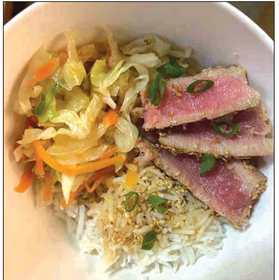
Asian Pan-Seared Tuna Steak goes well with rice and an Asian slaw.

I didn't grow up eating much seafood. The first time I had tuna steak in a restaurant (a loooooong time ago) was a game-changer. At the time, my experience with tuna was limited to the canned variety, so having it served to me seared on the outside and moist, tender and almost raw on the inside was amazing; and that's what I'll be sharing today. Thirty or forty years ago, it would have been harder than it is today to find sushi-grade tuna in stores. Now you don't have to go to shops specializing in seafood to get it. It pays to know where stores get it from, that you trust the quality and know if it's wild-caught or farm raised and, if farmed, what practices they employ. Most of what's offered may well be found frozen or previously frozen in markets in these parts, but that isn't necessarily a bad thing. Often things like tuna steaks and swordfish, even shrimp, are flash-frozen at peak freshness as soon as they're caught, sometimes even on the ships that haul them in. Doing so retains the flavor, texture and nutritional value for those of us not lucky enough to get it straight from the pier; and stores that sell it should disclose that it was previously frozen, so you know what you're getting. Freezing can also kill bacteria and parasites, which I hesitated to mention but thought you ought to know.