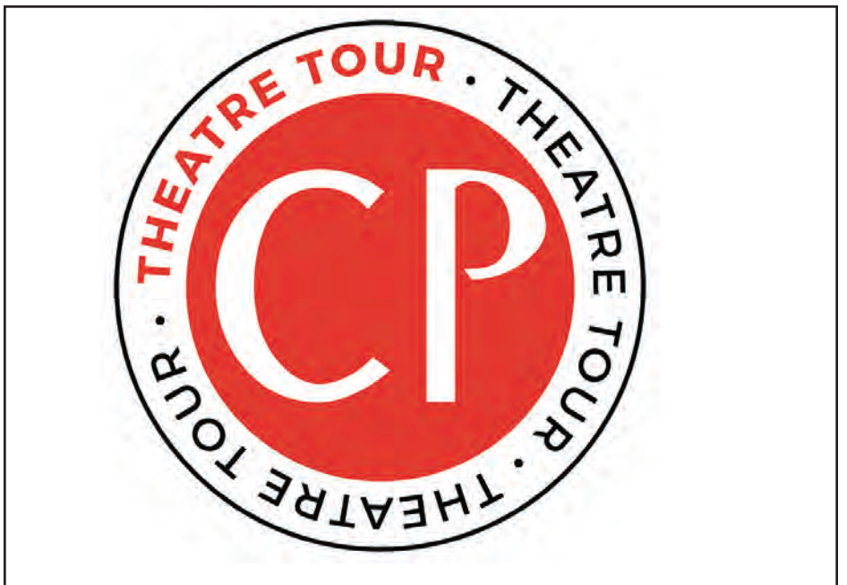
County Players will offer a free tour of the theatre on Saturday, April 5 in Wappingers Falls.

ing: free tickets to an upcoming main stage show; one of two annual subscriptions to their recently announced Season 68; or gift certificates donated by local