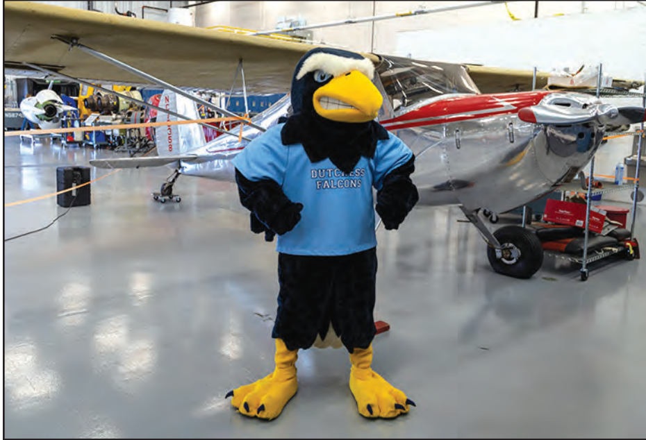
Dutchess Community College is now an official PSI Testing site for Federal Aviation Administration exams.