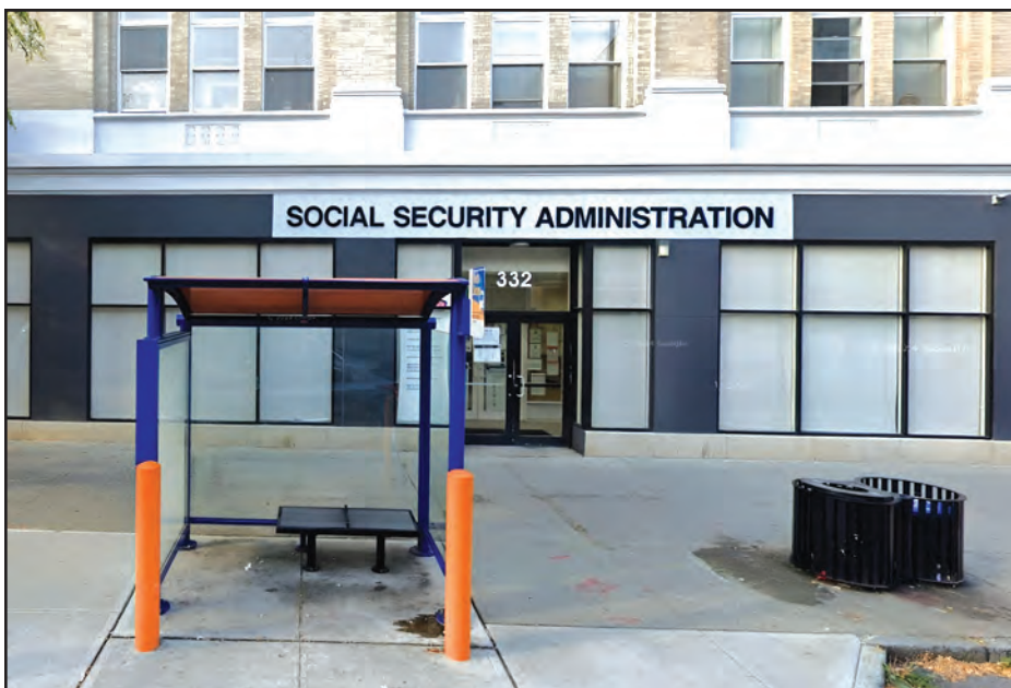
The Poughkeepsie Social Security Office – recently slated for temporary closure by the Department of Government Efficiency (DOGE) – has been removed from the DOGE savings website. This sparks hope that once renovations are complete, providing essential services will resume, according to Congressman Pat Ryan.

“While we are excited to hear that the Poughkeepsie Office seems to have been saved from DOGE for now, we know this fight is not over. The Social Security Administration (SSA) is limiting phone service and requiring in-person visits, while closing most of its offices and reducing personnel. These changes will discourage and make it extremely difficult for people to get their Social Security ben-