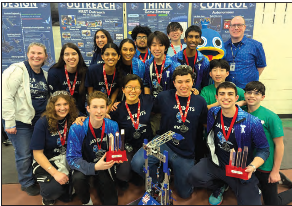
At the Regional Championship Tournament, the John Jay High School Varsity Robotics Team, the JAYBOTS made it to the final match in the playoffs along with their Alliance Partner Team Solar Flare.

The JAYBOTS also won the 3rd Place INSPIRE Award for excelling in all-judged categories.