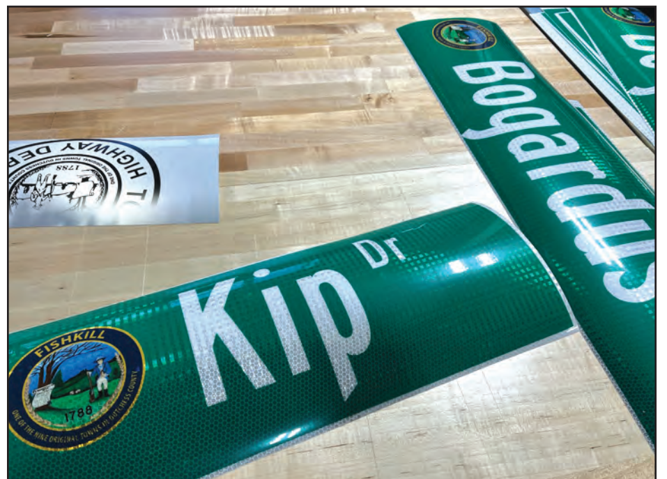
Some of the printed street signs before they are laminated and placed on metal backings.