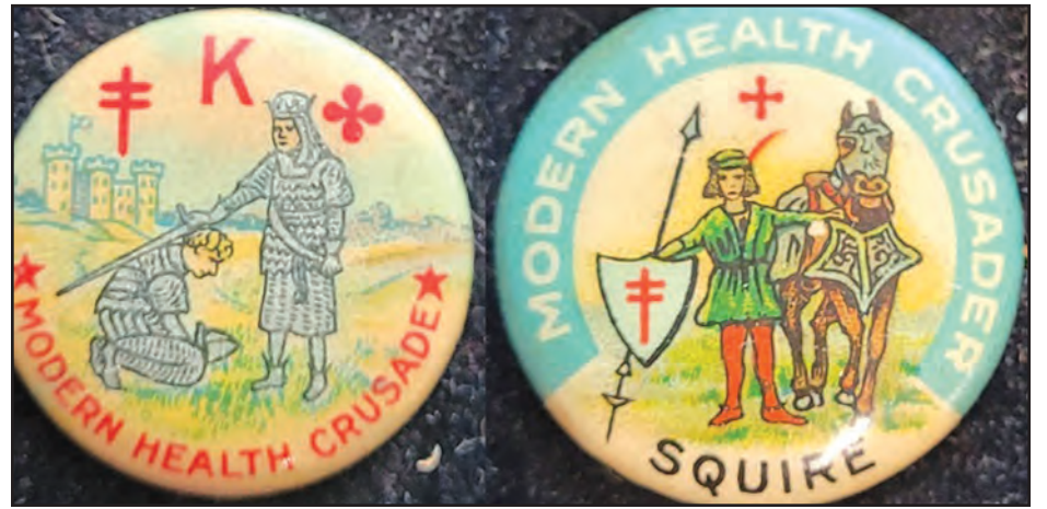
Above left: Pin for the rank of “Knight.” Image of King Arthur knighting a Health Crusader with Camelot in background. Above is the National Tuberculosis Associations cross, a “K” for “Knight,” and a Health Cross.