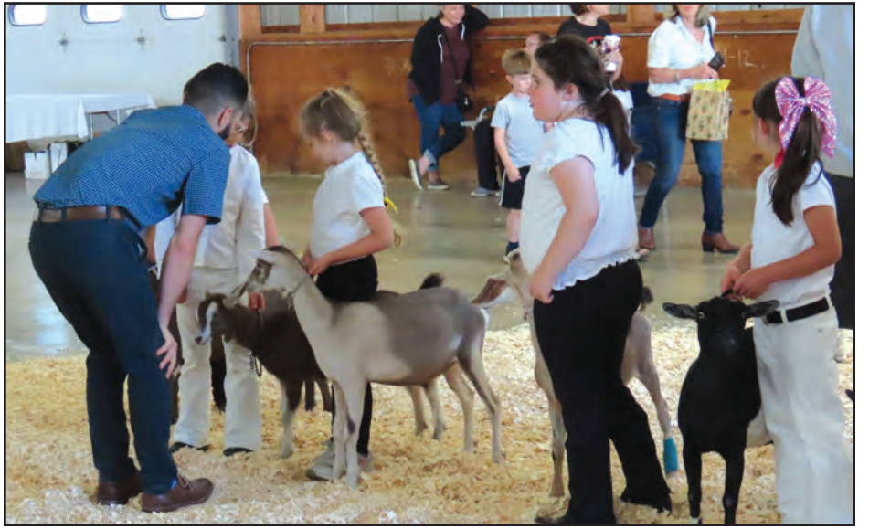
Youth take part in the Cloverbud Showmanship competition at the Open Youth Goat Show at the Dutchess County Fairgrounds.