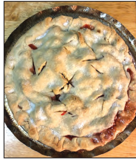
Above, a strawberry rhubarb pie. Right, a dirty martini.

Unlike appetizers, which are served before a meal, tapas is the meal and my favorite way of eating, grazing on a variety of small plates and finger food nibbles rather than an entrée. Traditionally, tapas are small plates of savory, often salty snacks and appetizers, usually served at no charge when drinks are ordered, in the afternoon or later in the evening. It originated in Spain when bar patrons would cover their drinks with a slice of cured meat to keep flies away (tapas means "to cover") but is now essentially bar food served with drinks and designed to make