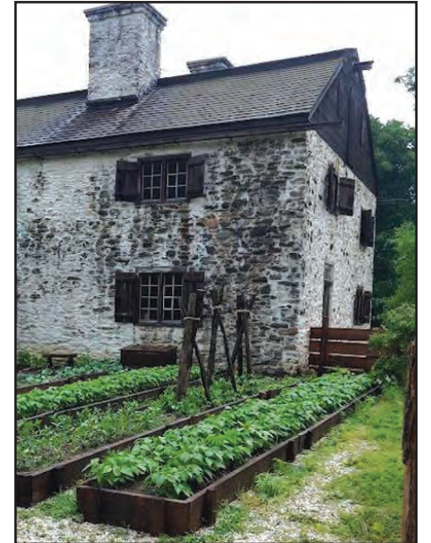
Philipsburg Manor house and garden.