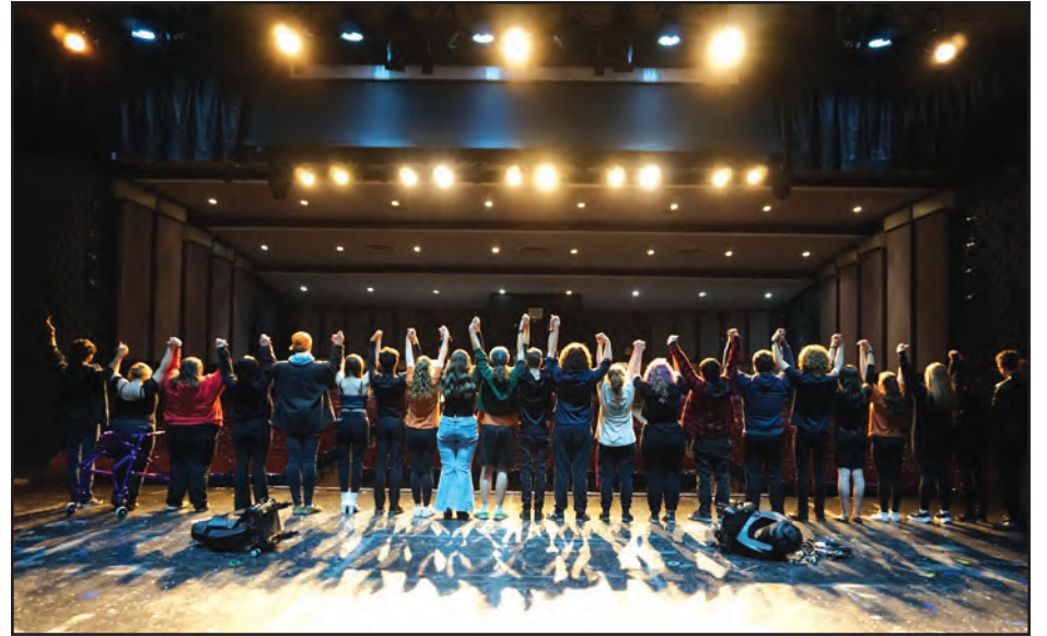
Roy C. Ketcham's Masque & Mime Society will celebrate its 60th anniversary on Sunday, June 23. The event will feature a concert at the Bové Theatre and then a reception at the River Valley Arts Center.