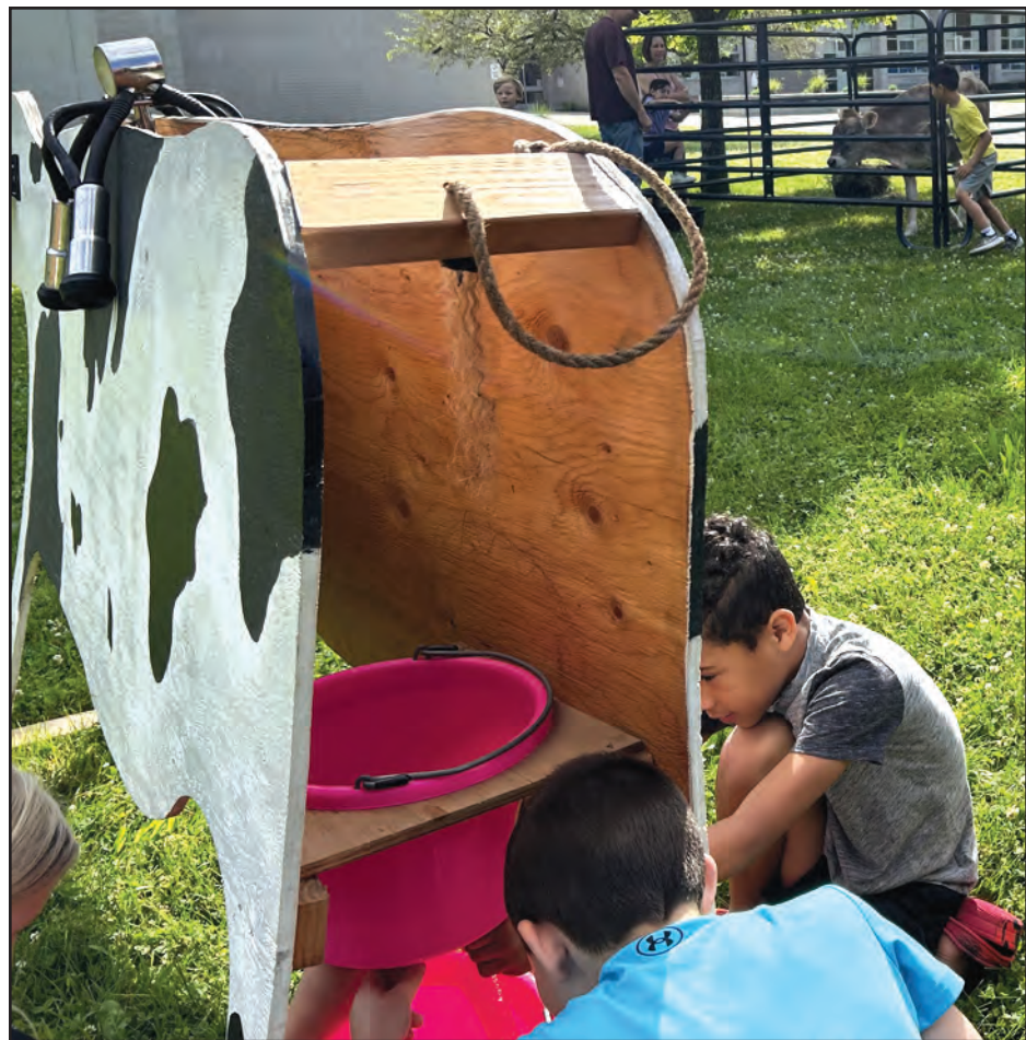
Youngsters learn the art of milking cows from artificial cow cutouts as part of the Agricultural Education program of the Dutchess County Agricultural Society.