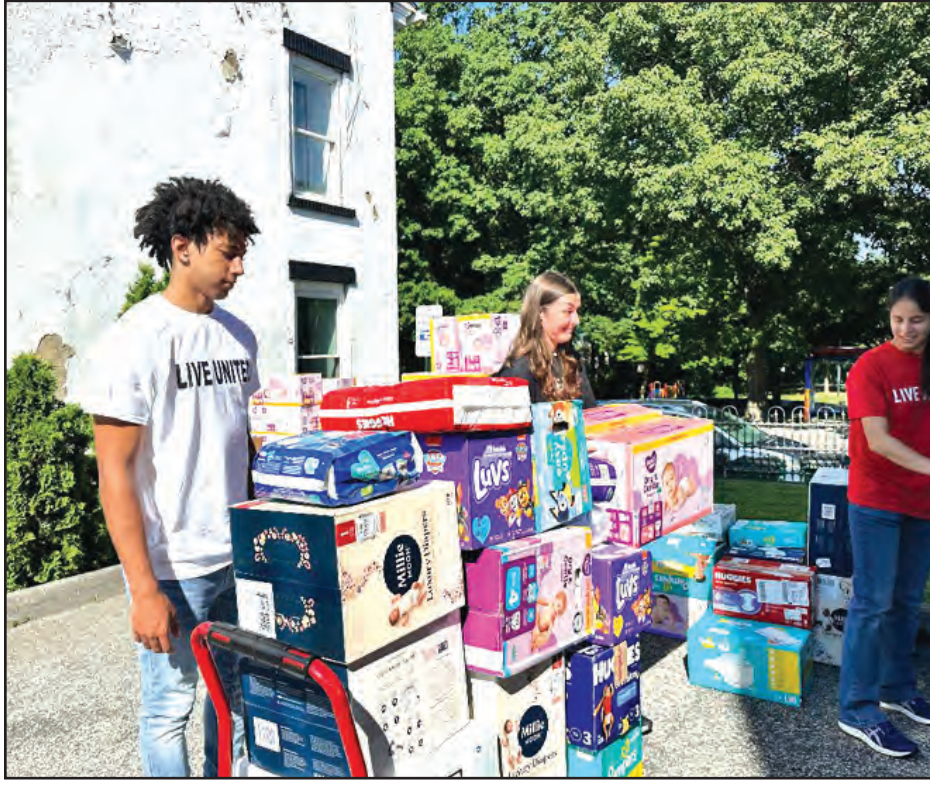
United Way of the Dutchess-Orange Region hosted its annual 100,000 Diaper Distribution event on July 26.