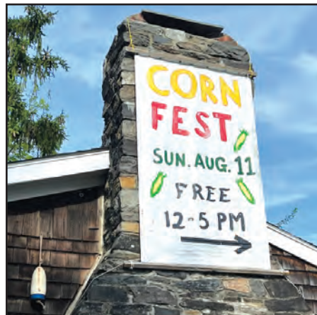
The annual Corn Fest hosted by the Beacon Sloop Club will be on Sunday, August 11 at the Pete & Toshi Seeger Riverfront Park in Beacon.