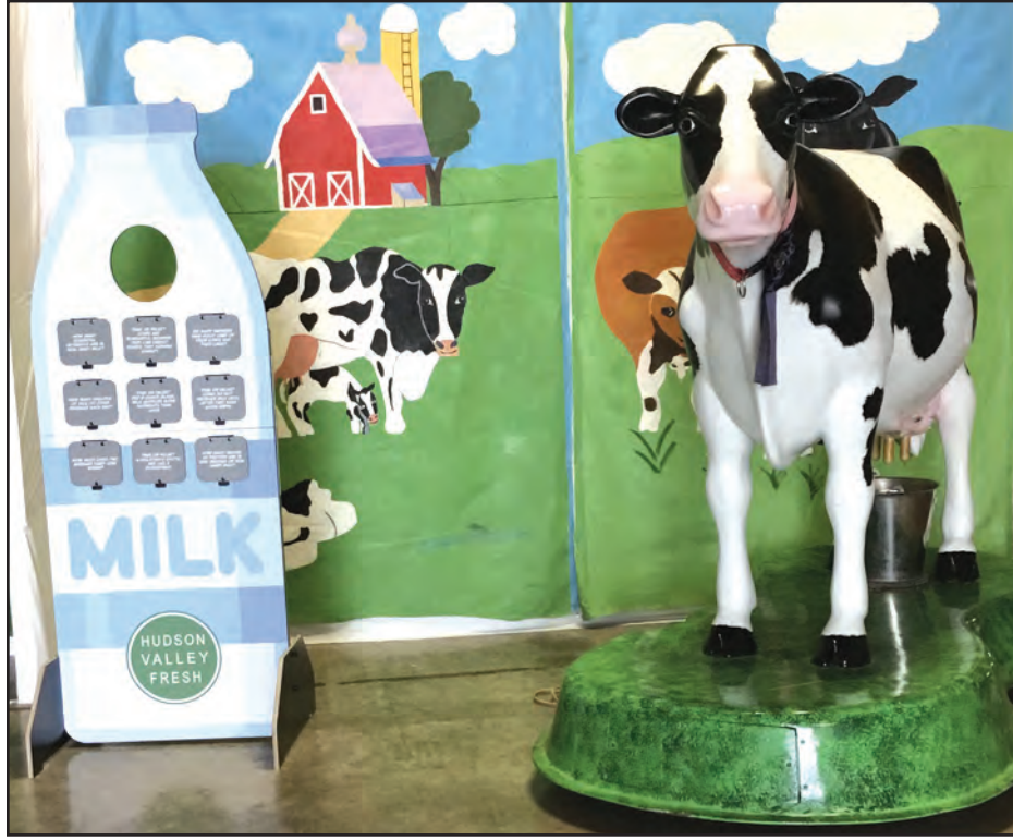
The AgriVenture Scavenger Hunt involves a variety of farm scenes and hands-on experiences with the mission of teaching children and adults about the benefits of agriculture.