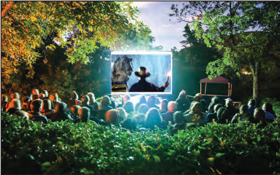
Movie Night on Bannerman Island will be held in August. One movie that will be shown is the classic "Jurassic Park," with Sam Neill, Laura Dern and Jeff Goldblum, on August 23.

The following events will be held in August by the Bannerman Castle Trust.