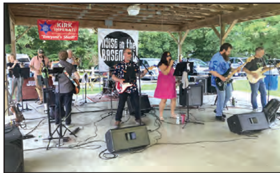
Noise in the Basement will hold a concert in Poughkeepsie on August 13. Pictured is the band from the 2023 concert in Poughkeepsie.