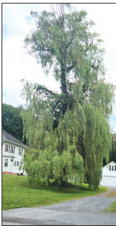
A willow tree in Pleasant Valley.