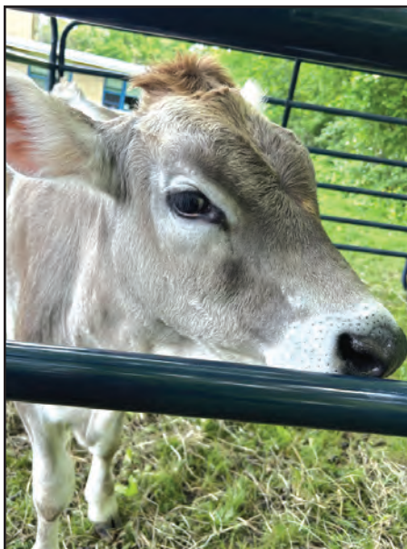
“Starburst” the calf is part of a program by the Dutchess County Agricultural Society that visits area schools. “Starburst” is from Stormfield Swiss Dairy Farm.

They will have local businesses from the community attending plus donation collections for the Dutchess County SPCA and the Hyde Park Food Pantry.