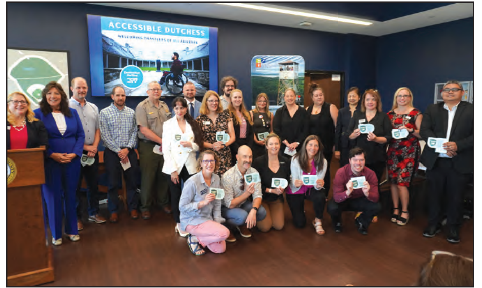
Wheel the World, a leader in travel solutions for people with disabilities, designated Dutchess County with a Verified Destination certification. A presentation was held at Heritage Stadium in Fishkill on July 25.