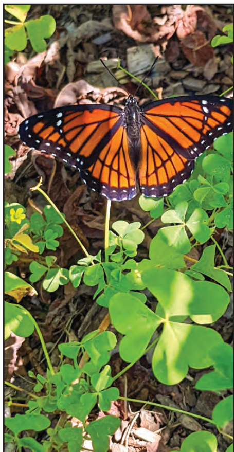
Viceroy at Willow Vale Farm.