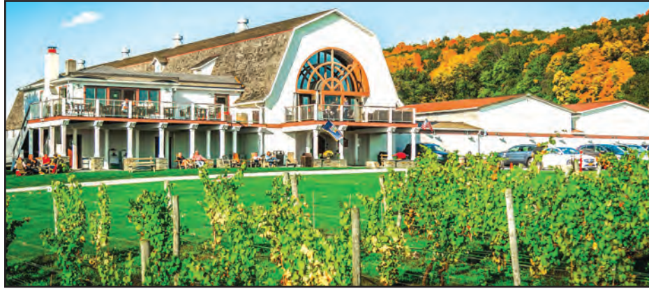
Just in time for the holiday season, Millbrook Vineyards & Winery (Millbrook Winery) is accepting custom wine bottle label orders.

The process is simple – customers select from Millbrook Winery’s award-winning varietals and add a unique, professionally designed label, created by the winery’s graphic designer. Each bottle can feature the recipient’s name, a company logo or a special message on the selection of label templates or