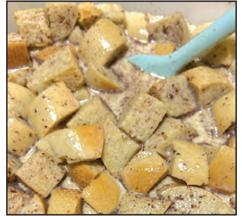
A slightly stale loaf, cut into cubes, gives a desirable texture to bread pudding.

The addition of a simple caramel made with brown sugar and used as a thin bottom layer adds not only rich sweetness but also a pleasant chewy texture, and a topping of cinnamon streusel helps crisp up the top and makes the kitchen smell amazing as it bakes.