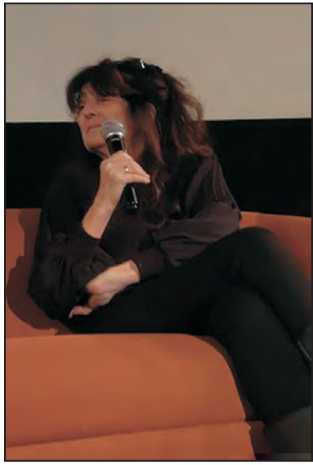
Ruth Reichl at Upstate Films.

For more information, please call 845-632-1281.