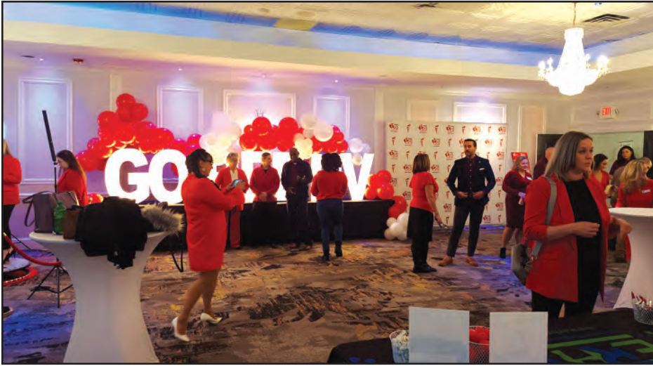
Attendees at the annual Go Red for Women Luncheon in Poughkeepsie on Nov. 14.

Two hundred women – and some men – gathered on Nov. 14 to fight the No. 1 killer of women, heart disease, at the 2024 Hudson Valley Go Red for Women Luncheon at the Double Tree by Hilton in Poughkeepsie.