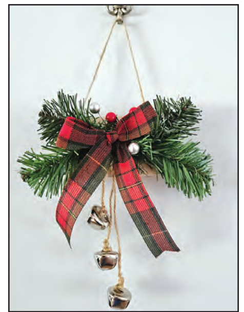
The Verplanck Garden Club members will hold the annual Children's Holiday Craft Workshop on Saturday, Nov. 23 on the lower level of the Fishkill Town Hall, 807 Route 52, in Fishkill. Children can make a reindeer ornament, left and an evergreen door hanger.