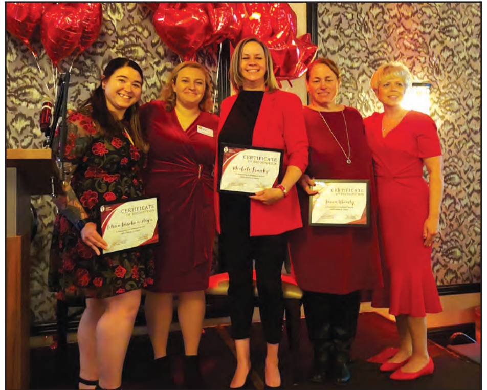
Women of Impact were recognized during the annual luncheon.