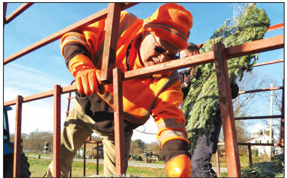
Volunteers help to unload Christmas trees during the 2023 “Trees for Troops” collection effort at Hahn Farm in Salt Point.

“We had two coin drops this year and have received many other donations,”