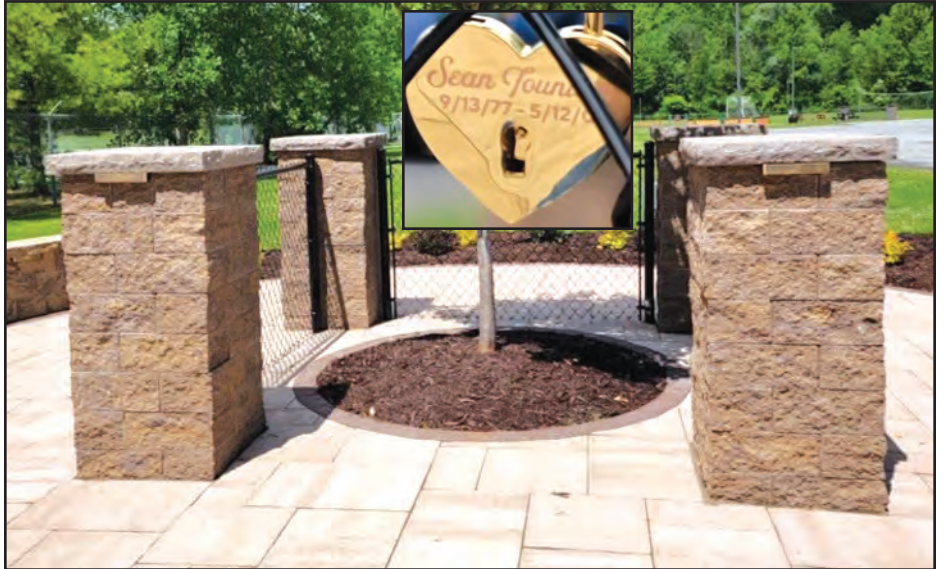
The Overdose Awareness Memorial on the Dutchess County Rail Trail includes a padlock on the fence (free for anyone in the community to place in remembrance) and the memorial to which all are welcome. A ribbon-cutting event was held in 2022.

In the over 30 years since this Foundation was founded, it has helped thousands of people who have become clean and sober, witnessing miraculous journeys of recovery from people who were often written off by their families, employers and, most importantly, by themselves as being beyond help. Sadly, countless others are still being caught in the grips of this devastating disease.