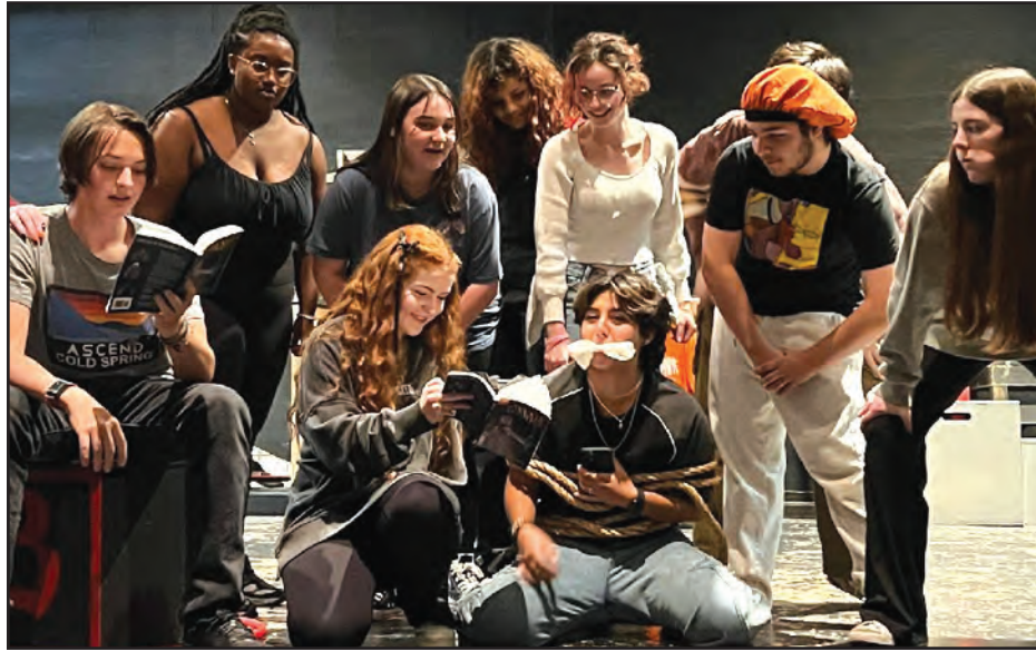
Masque & Mime, the drama club at Roy C. Ketcham High School, will take flight in "Wendy & Peter Pan," in the Bove Theatre at the high school from Nov. 22-24.