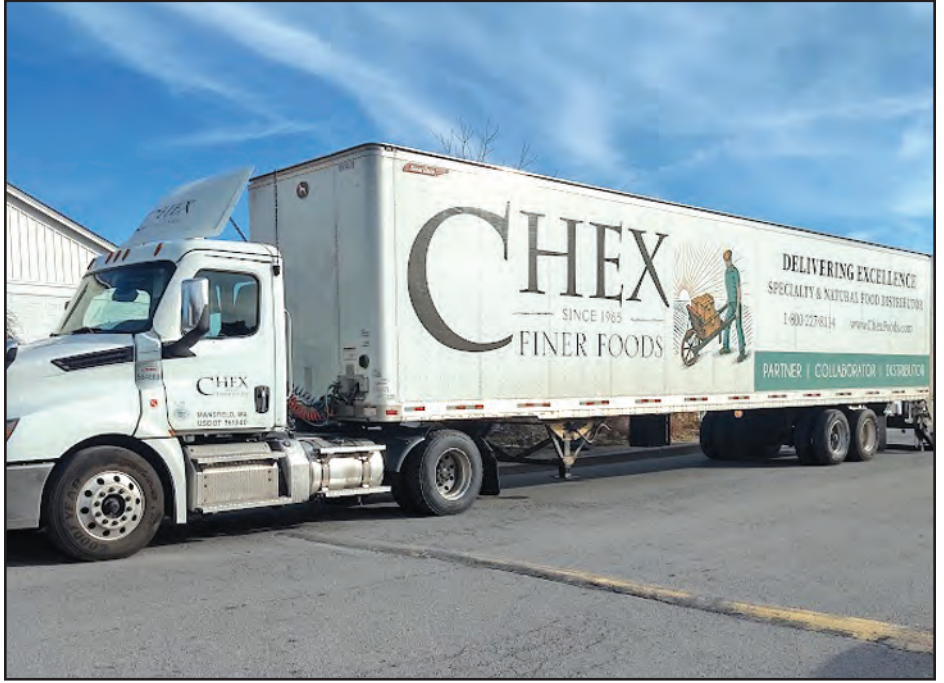
Distributors pave the way.