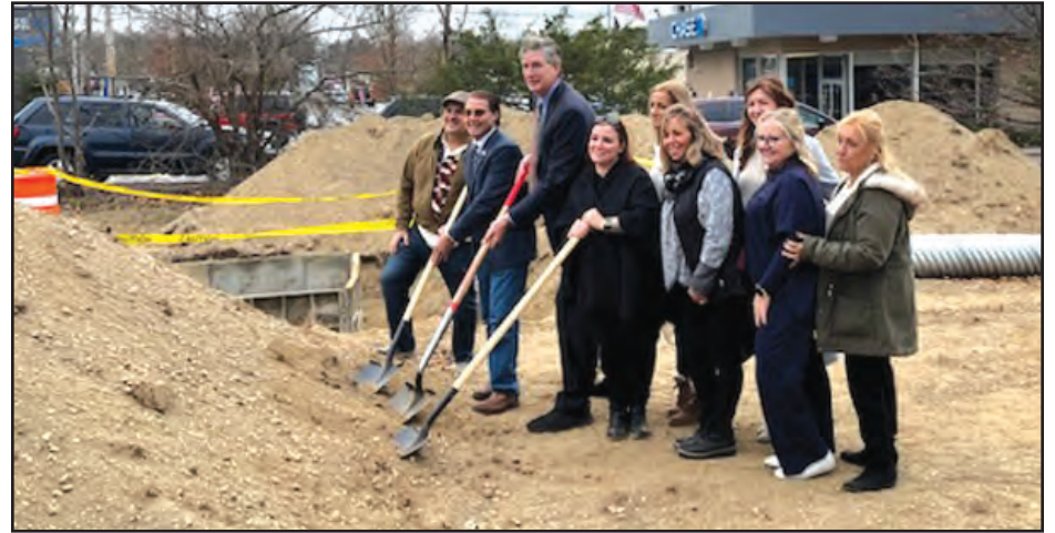
Rotarians from the Rotary of East Fishkill take part in the ceremonial groundbreaking for the flagpole at Rotary Park, off Route 82, in the hamlet of Hopewell Junction in East Fishkill on Nov. 10.