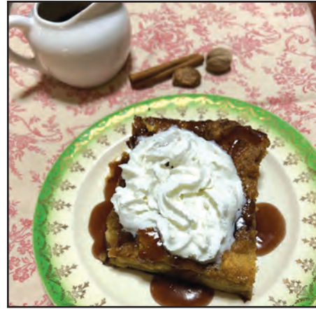
A plate of French Toast Pudding.

What makes it shout French toast is the cinnamon. The egg-milk batter usually used to drench the bread before pan frying is the base for the custard with a few adjustments.