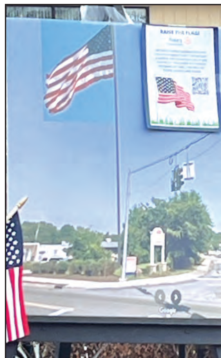
A rendering of the American flag and flagpole at Rotary Park in East Fishkill.