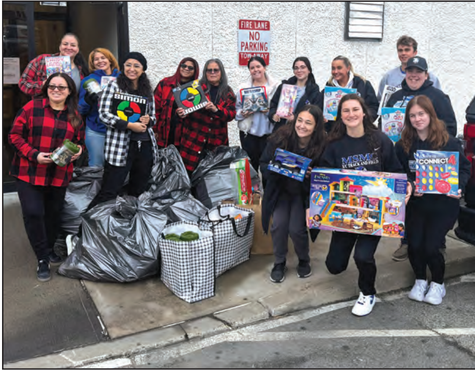
This year, Santa Claus is getting a little help from his friends in the Hudson Valley. The Mount Saint Mary College community and generous friends of the college teamed up to make this holiday season a little brighter for families in need, to the tune of more than 700 toys.