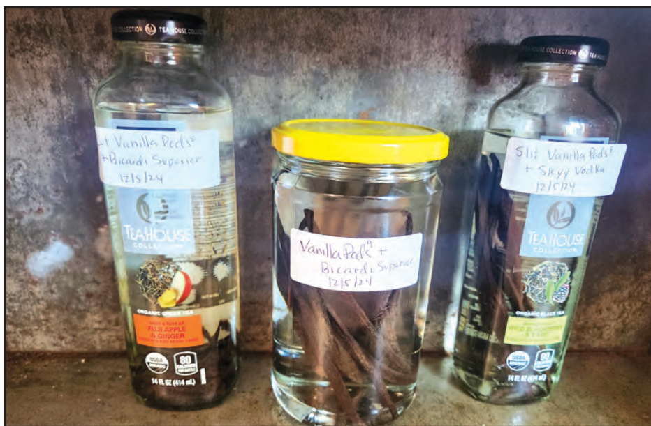
Store DIY vanilla extract in a cool, dark, dry place for 6-12 months.

Greene County and spent over 3 decades teaching in Ulster County. She creates science-themed instructional materials and books, as well as being a Citizen Scientist in the management of her current home in an enchanted woodland of Dutchess County. Find her at https://medium.com/@wiznerf , https://substack.com/@gkatzchronicle , and https://www.pleasantvalleymaplelodging.com/ .