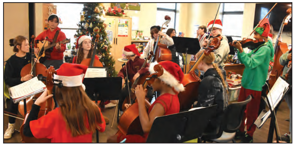
Union Vale Middle School students bring music - and holiday cheer - to senior citizens at the Dutchess County Office for the Aging in Poughkeepsie.