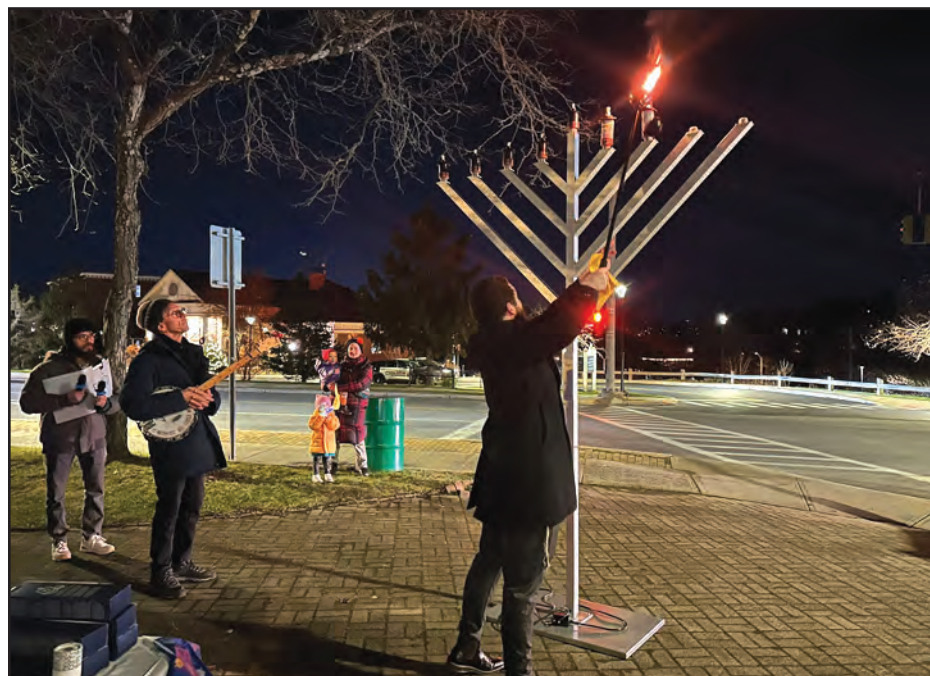
Right: Beacon's Grand Menorah Lighting will take place at Polhill Park, off Route 9D, on December 29 in Beacon. Pictured is from last year's ceremony.

If one needs candles, they will have candles at the event for attendees to light.