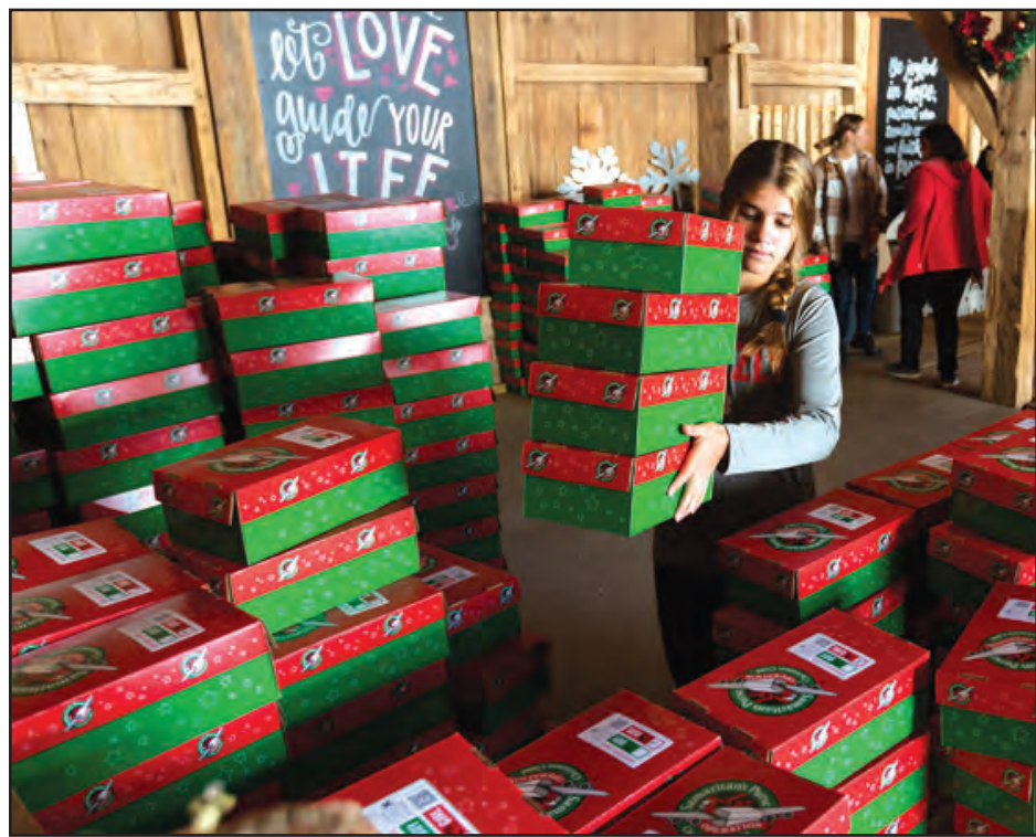
Children worldwide will receive shoeboxes filled with necessities, toys and school supplies as part of Operation Christmas Child by Samaritan's Purse.

Vol. 73, # 52 75 cents Fishkill, East Fishkill, Wappingers Falls, Town of Wappinger, Town and City of Poughkeepsie December 25-31, 2024