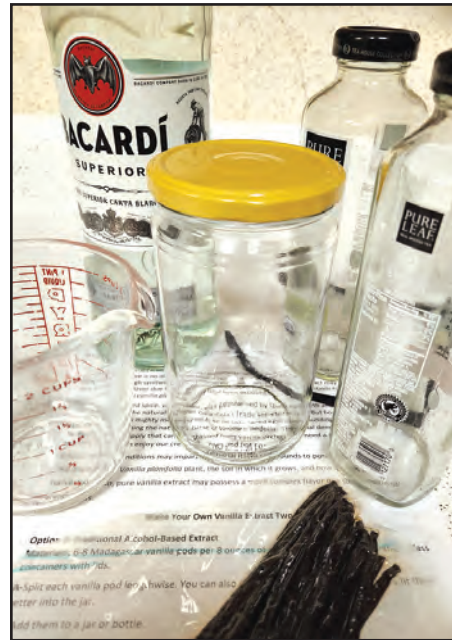
DIY vanilla extract.

Chemically, there is no difference between vanillin derived from vanilla plants and vanillin prepared through synthetic or fermentation methods. It is true, however, that pure vanilla extract may possess a more complex flavor and is made up of just three ingredients. I made some, but I'll need to wait till December 2025 to try it. If you are