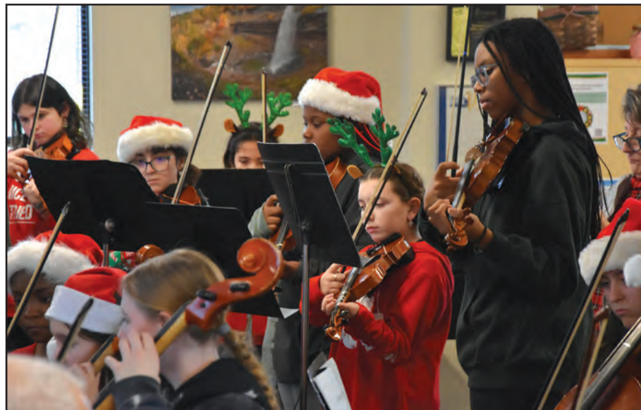
Students with the Union Vale Middle School String Ensemble perform holiday songs for senior residents at the Dutchess County Office for the Aging in Poughkeepsie on Dec. 18.