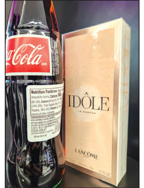
Coke & Lancôme Idôle Eau de Parfum both have Vanilla-1.

interested in a kitchen, chemistry, or holiday deep-dive into vanilla, check out Vanillin: A Mighty Molecule at https://www.teachers-payteachers.com/Product/Vanillin-A-Mighty-Molecule-Enrichment-Cross-Curricular-Ecology-Genetics-12631665