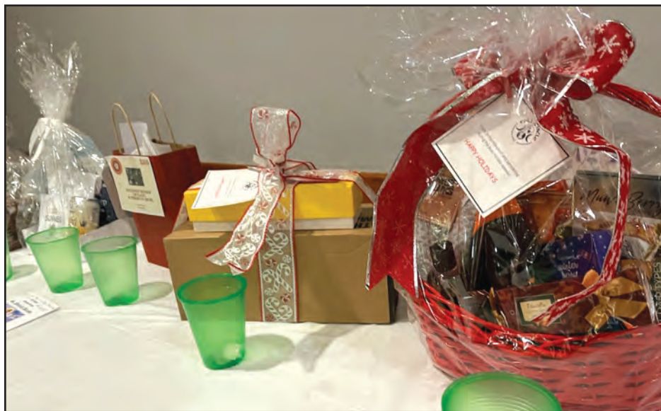
Some of the items that were raffled off during the luncheon.