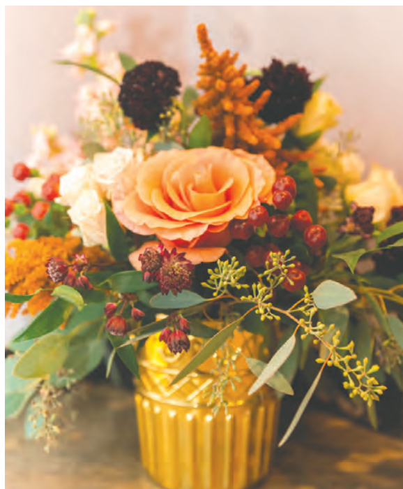
Choose special floral displays for upcoming holiday dinners and events at Peony Design Studio in Pleasant Valley.