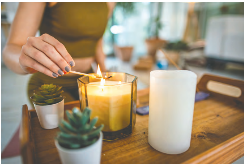
For safety with candles, place them on stable surfaces in sturdy holders and blow them out before leaving a room.

• Cooking: Unattended cooking is the leading cause of house fires in the U.S. That's why I always keep a close eye on the stove and ensure a fire extinguisher is nearby. I also make sure to declutter my cooking area, turn pot handles toward the back, and keep small children and pets at a safe distance.