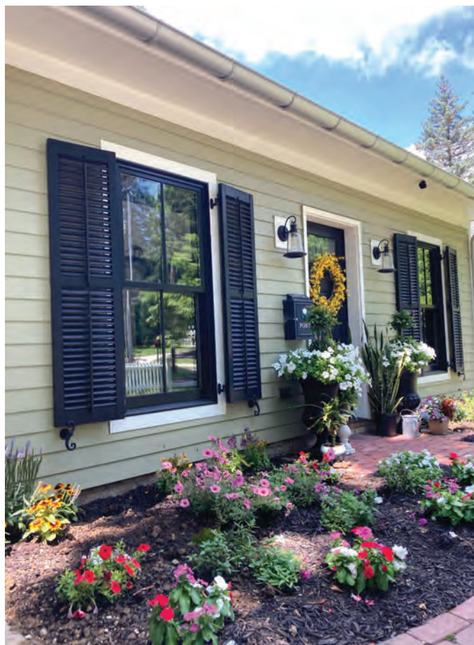
Shuttercraft provides windows, shutters and hardware for renovation, restoration and new construction, plus full painting services.