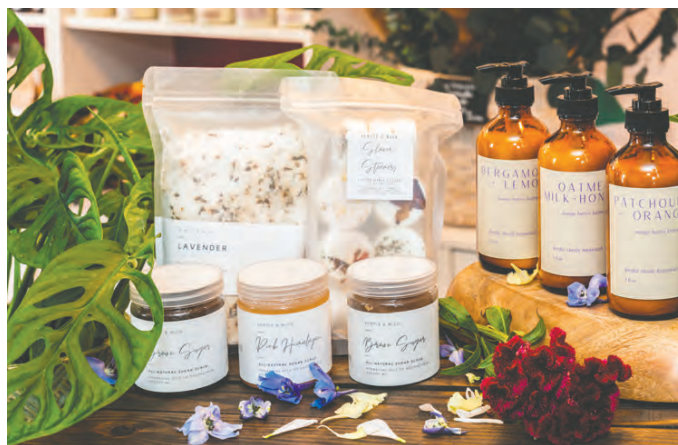
A wide variety of skin care and plant care products are among the many products available at Peony Design Studio.

Turn your Thanksgiving moments into memories. Our diverse selection of fresh blooms with their lush petals and rich hues, will add a touch of elegance to your holiday table. Explore