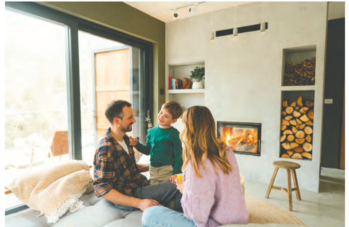
For safety with fireplaces, make sure to have the chimney inspected and cleaned at least once a year to prevent fire hazards. Also use a sturdy fireplace screen to keep any sparks contained.

• Grilling: If I'm grilling in colder months, I protect my grill with a cover or store it indoors to keep it clean and shielded from the elements. I always disconnect the propane tank and leave it outside for safe storage, as propane should never be kept indoors. Before storing my grill, I let it cool off completely to avoid putting a hot grill in my garage or shed.