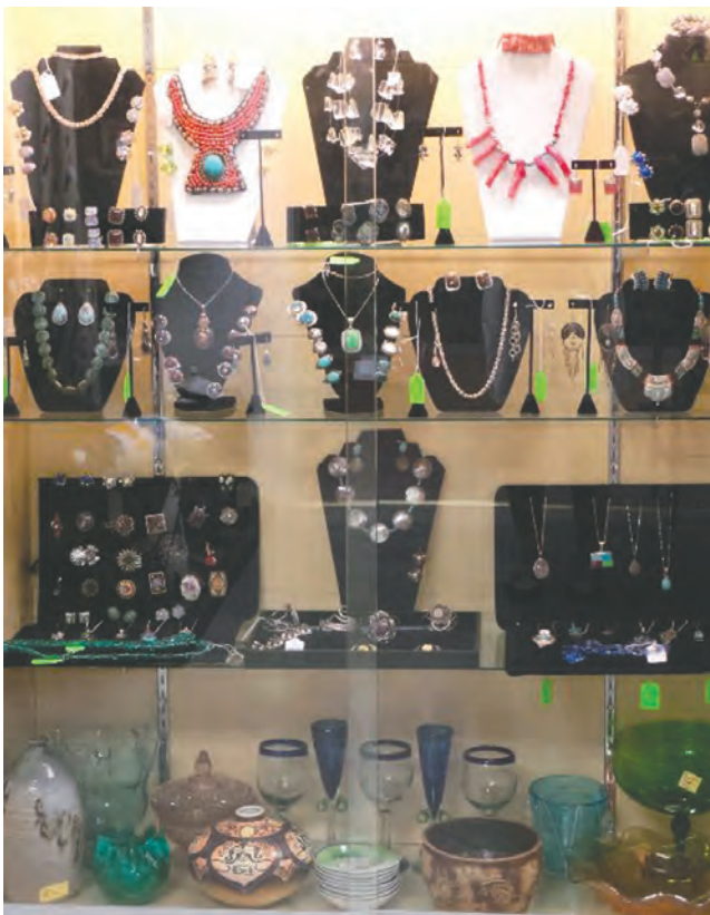
Rhinebeck Antique Emporium features furniture, collectibles, costume jewelry, silver, porcelain, paintings, oriental rugs, tapestries, and more.

Visit rhinebeckantiqueemporium.com for more information and see many photos on Instagram. Call (845) 876-8168.